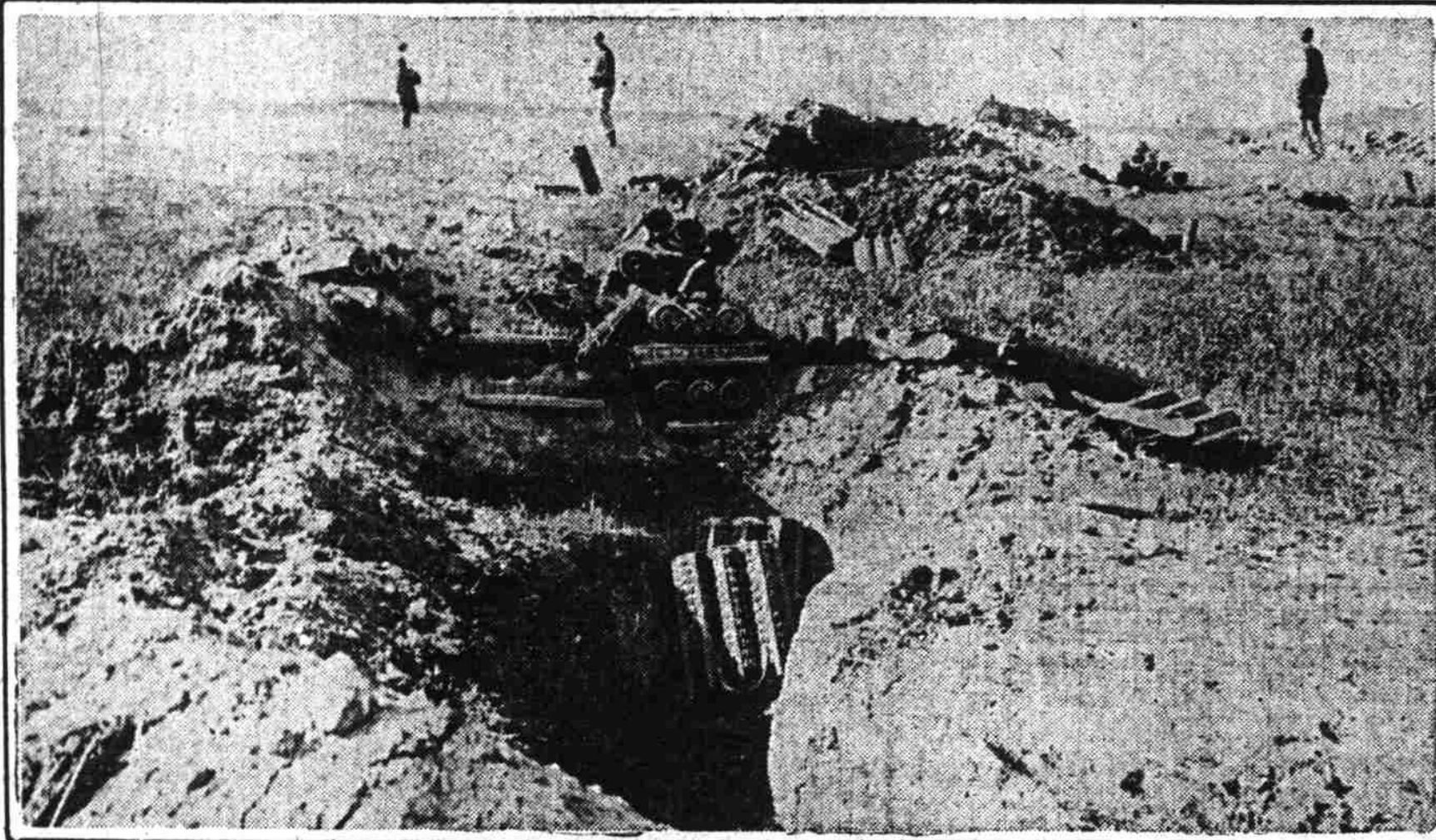
ON THE BATTLEFIELD NEAR RHEIMS

Painters, sculptors, actors and journalists of England have banded together for the home defense of the mother country. The members are here seen assembled in Earl's court, London, where they were addressed by Major General Sir Alfred Turner. In the ranks are many distinguished men of letters.