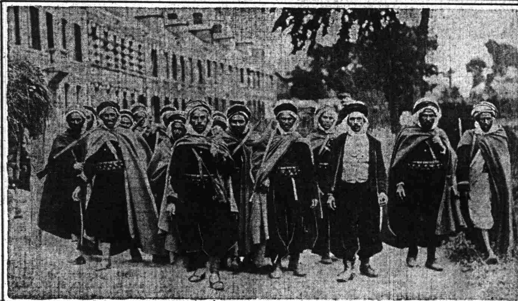
THE ALGERIANS AT ARRAS

This photograph shows gun intrenchments erected by the Germans near Rheims, which were hurriedly abandoned when the kaiser's men retreated. Great excavations have been made in the midst of a harvest field to provide protected places for the field guns which, however, were not abandoned when the army withdrew.