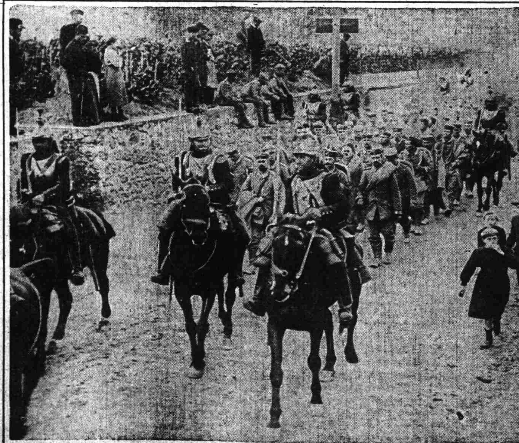
GERMAN PRISONERS BEING ESCORTED TO CAMP

Here are a group of fighting men from sunny Africa who have taken part in some bitter engagements in northern France. Their Arab garb is in striking contrast to the uniforms of their French colleagues, but the wearers are said not to suffer in fighting qualities therefor. Their conduct in action is superb.