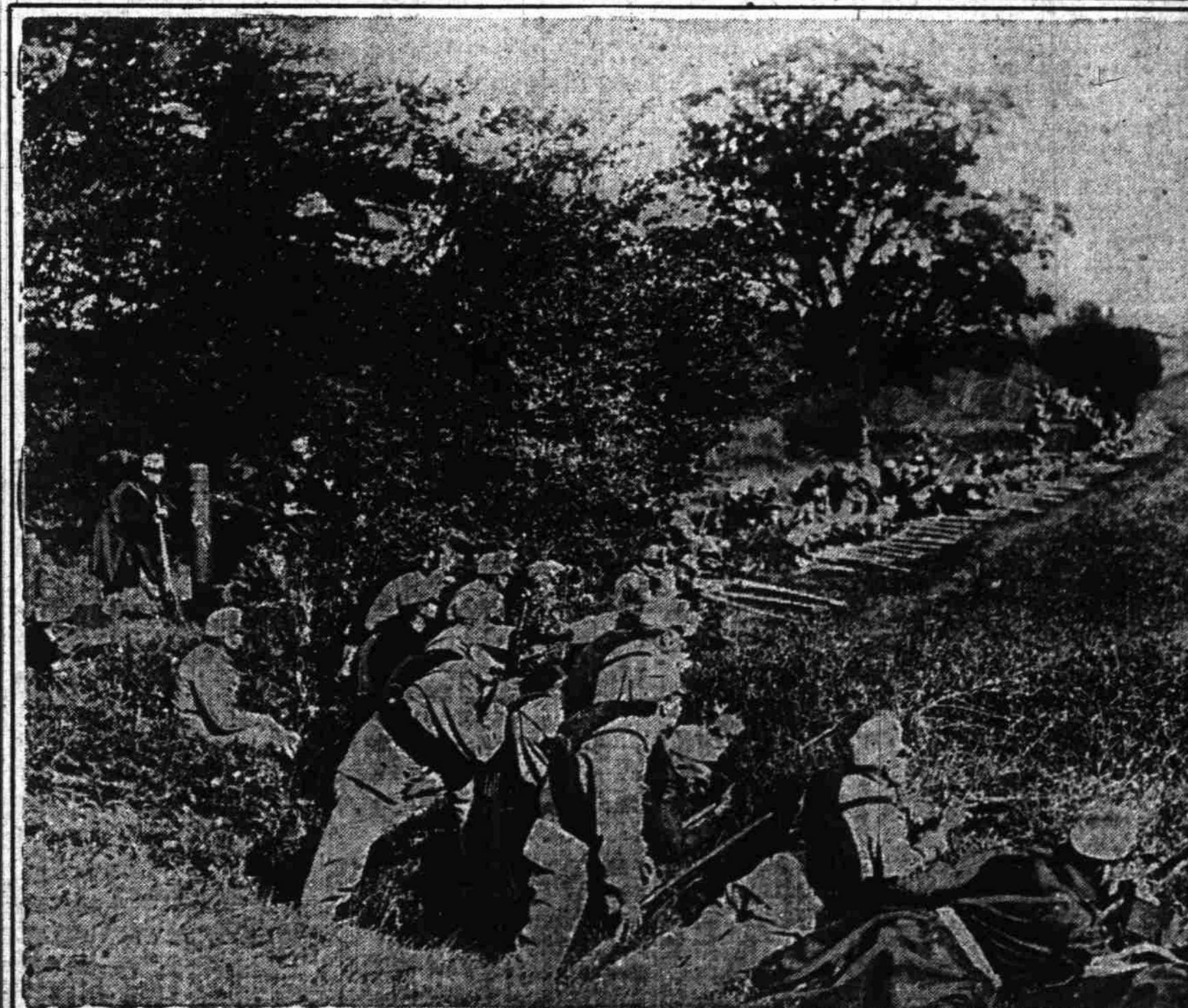
AUSTRIAN INFANTRYMEN IN ACTION

These warriors were captured near Rheims, and are being escorted by some French cuirassiers to the concentration camp near Paris, where they will be held captive until the war is over, or until an exchange of prisoners may have been effected between Germany and France.