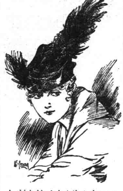
A chick black hat that shows a draped crown.

By Lillian E. Young. At least there is more variety in hats this season than there has been for some time past, for now that large brimmed models have returned once more and the small shapes have not by any means been ousted, there are plenty of shapes and a wide enough choice for all to be satisfied. All of the broad brimmed shapes are worn at a very pronounced angle and trimmings are kept very flat to the brim, while the small hats give the effect of being tilted by sloping and upstanding trimmings. Some of the small models show draped crowns and these are very modish in velvets or beaver velours. The latter material in black is used in the illustrated example of this idea and will make the smartest sort of a street hat with trimmings of black leather fantasies, a draped crown, and an upturned rippled brim. Since aigrettes are barred the best of the long feathered mounts are of heron, numidi, paradise, and burnt ostrich plumage. Since it insists upon moderation without curtailing variety we are all delighted with the millinery situation.