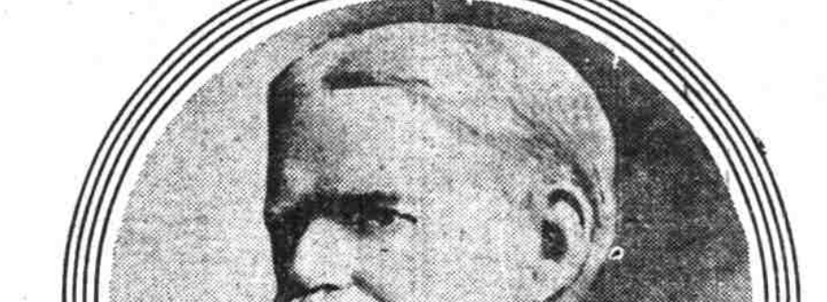
Colonel Henry Watterson.