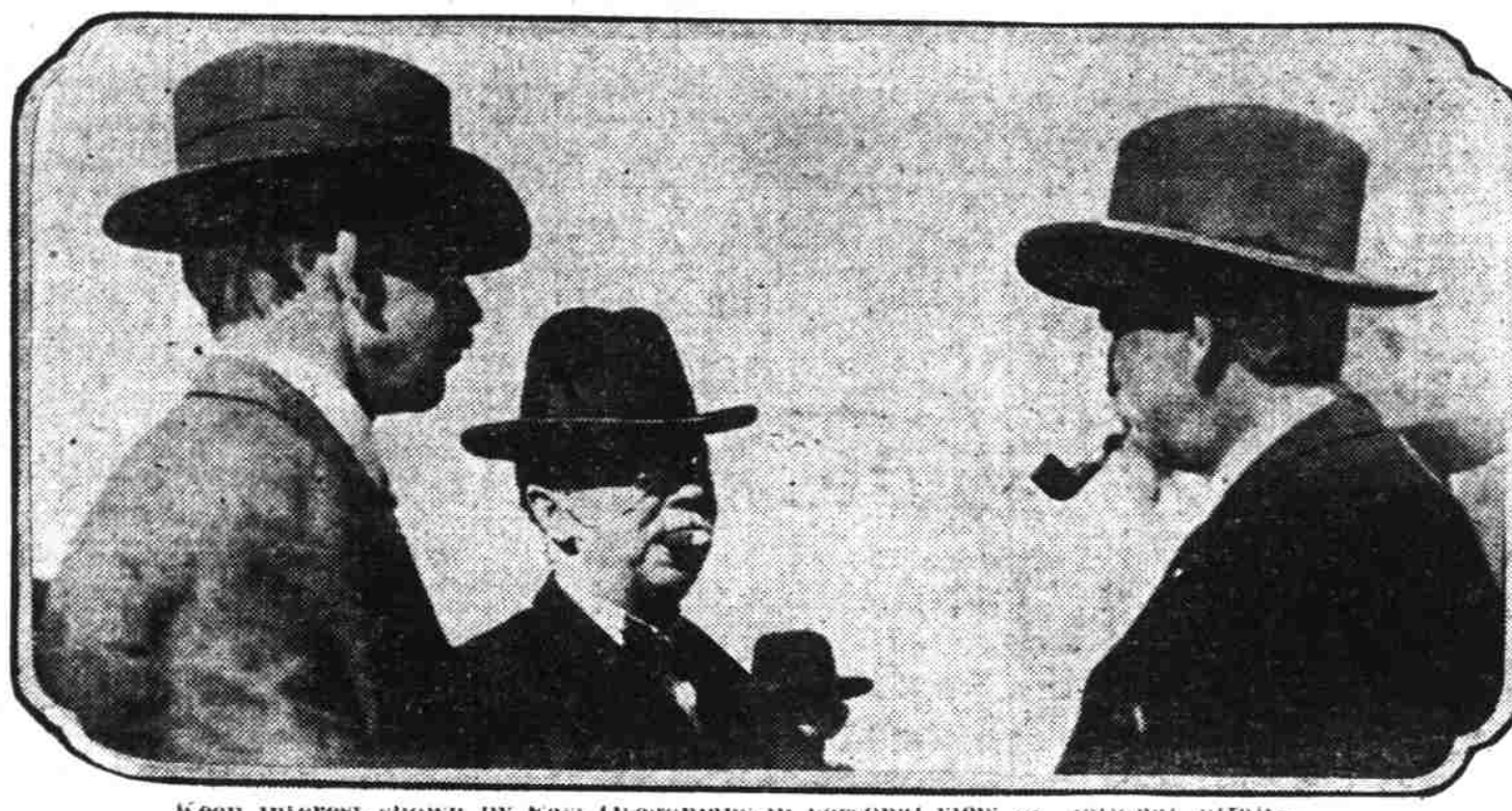
Keen interest shown by East Oregonians in personal view of national affairs.