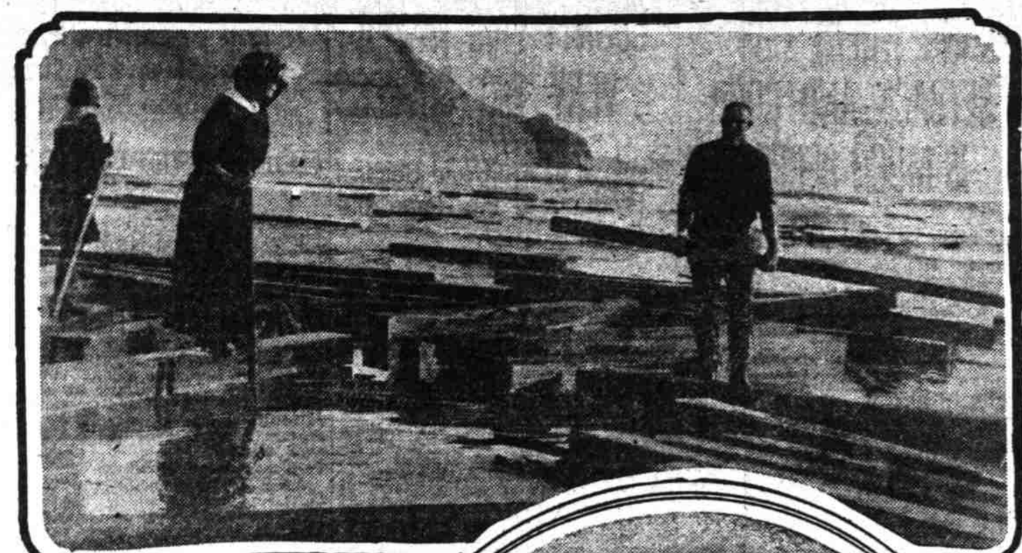
Top—Ties from deck of ill-fated Francis Leggett, drifting ashore between Neah-Kah-Nie mountain and Nehalem river.