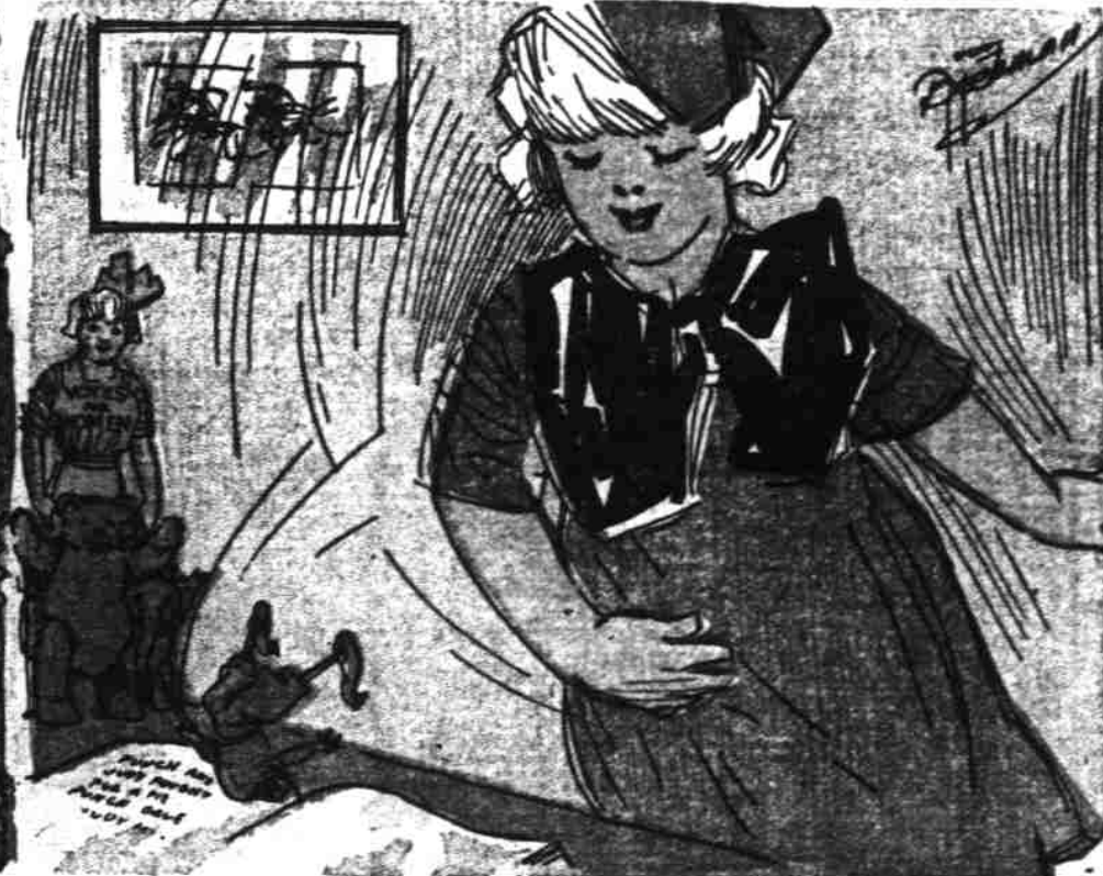
"I see no mirth nor common sense In fun at other folk's expense."