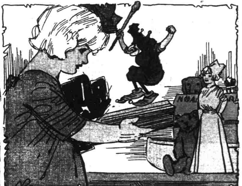
And out jumps Punch. "A showman old Am I," he cries. "My fun behold!"