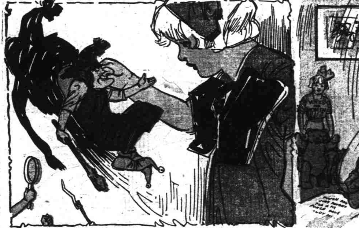
Punch growls, "You said you wanted fun!" "I did," says Dot, "not murder done.