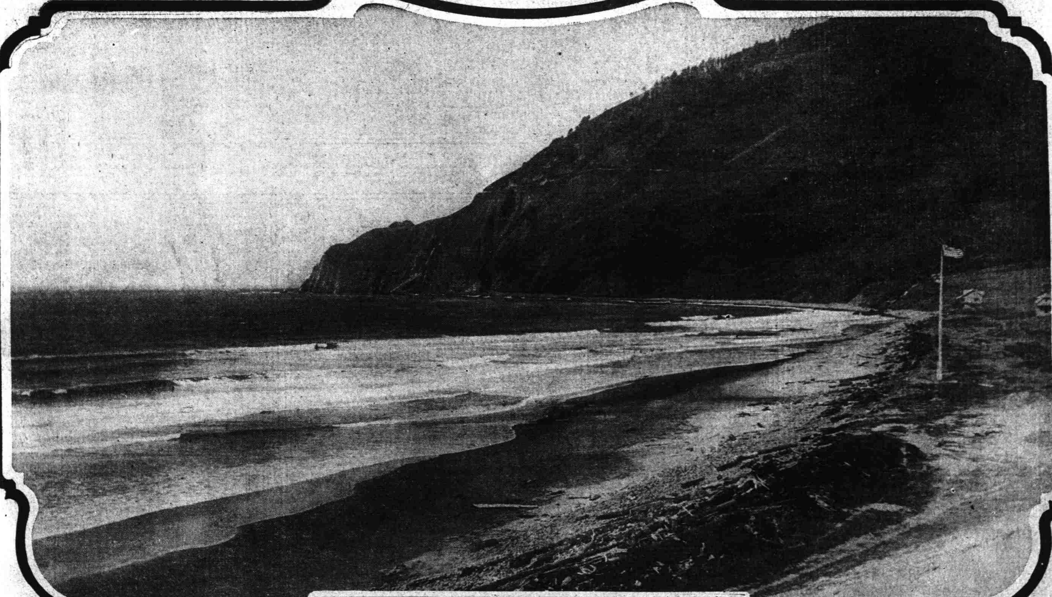
A BIT OF OREGON BEACH WITH NEAH-KAH-NIE MT. IN THE BACKGROUND