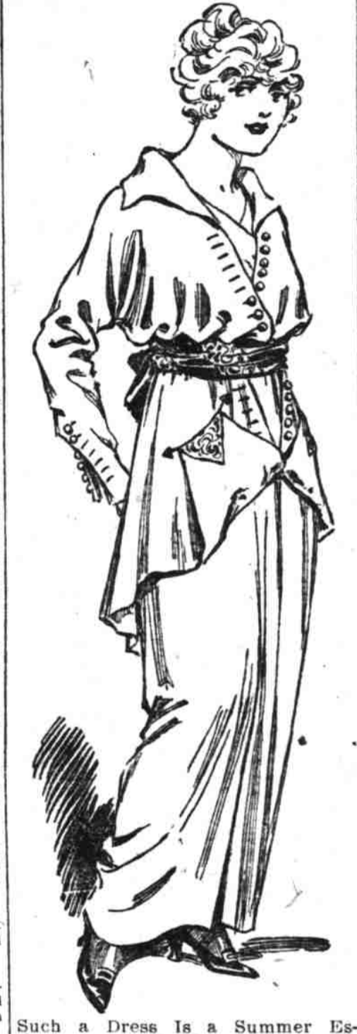
Such a Dress is a Summer Essential.