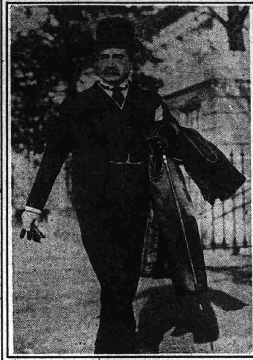
COMPTROLLER OF THE CURRENCY John Skelton Williams, who declares that the new banking system will "crush" the vicious power of invisible government.