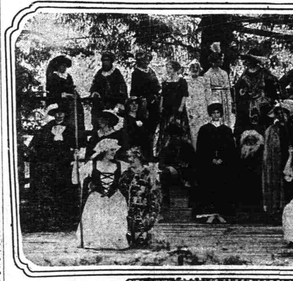
Senior players in "As You Like It."