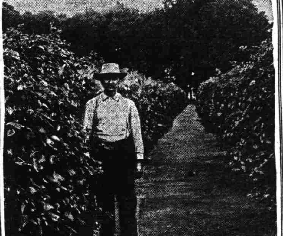
Lower picture—View of loganberry patch before picking the 50 acre yard of Aspinwall Brothers.

Chicago Market Is Quoted Higher at the Opening but Loses Later in the Day; Shorts Hustle to Cover on the Early Movement.