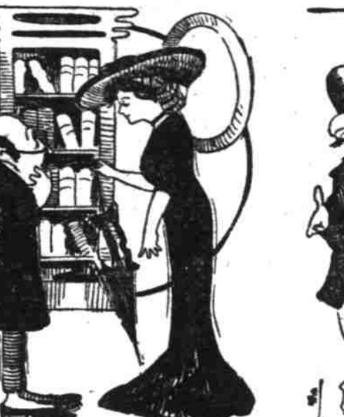
Young Lady—Doctor, I'm going on a trip; can you tell me how to avoid seasickness? Wise Doc—Take a train.