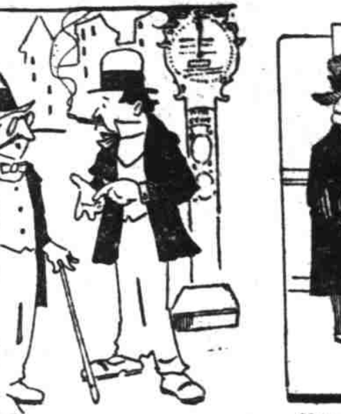
Goodbye—in this town, old man, you can't get away any place without dropping a dollar or two. Wiseguy—Drop a cent in a scale there and get a weight with it.