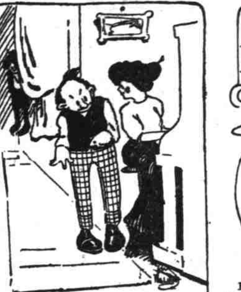
Dad—What's your objection to that young fellow, Jaysport? First Chauffeur—His clothes are so awfully pronounced and his English is pronounced so awfully.