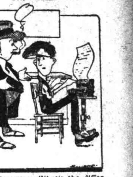
New Reporter—What's the difference between a writer and an author? Old Reporter—if a writer is invited to a big dinner he becomes an author.