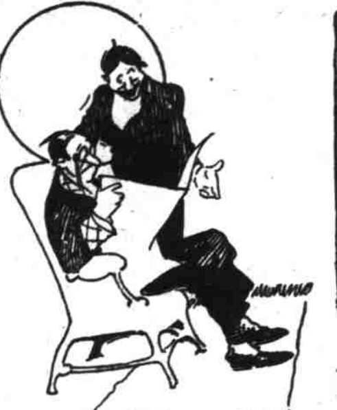
Sunniface—I hear the joke writers have a union. Think they'll ever go on strike? Grouchmore—No such luck.