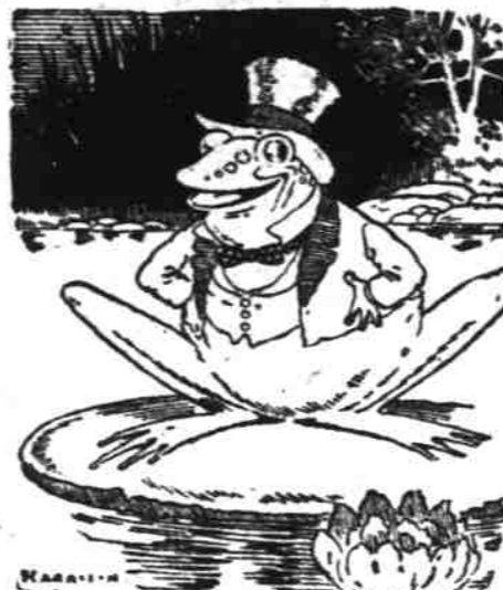
guess they're there now," replied Buster.

Jimmy's face fell. The log was so big that he knew that he couldn't budge it if he tried all day. He was just about to say something unpleasant when Buster walked over to the old log, hooked his big claws into it and gave a great pull. Over rolled the log. A dozen fat beetles started to scurry for another hiding place. In no time at all they all had found one. It was in the stomach of Jimmy Skunk. He looked up at the twinkling eyes of Buster Bear.