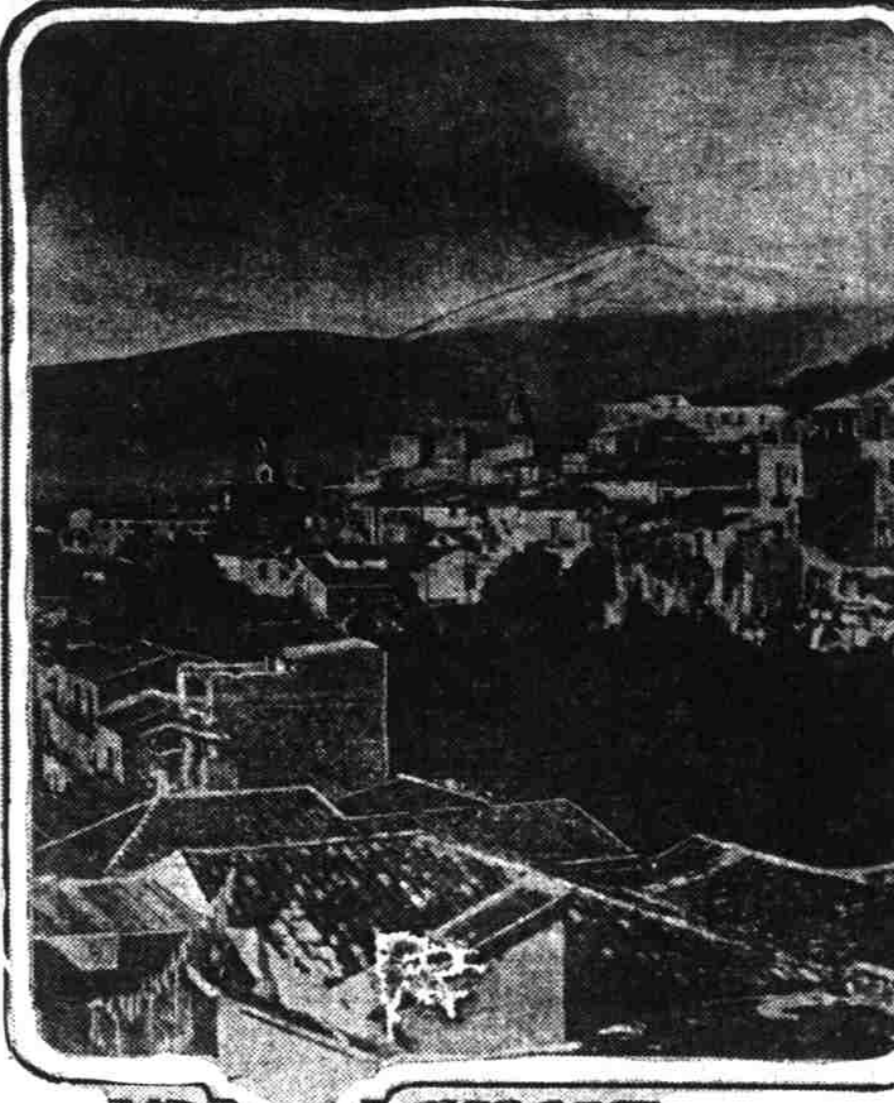
View taken from town of Taormina in May, 1908.