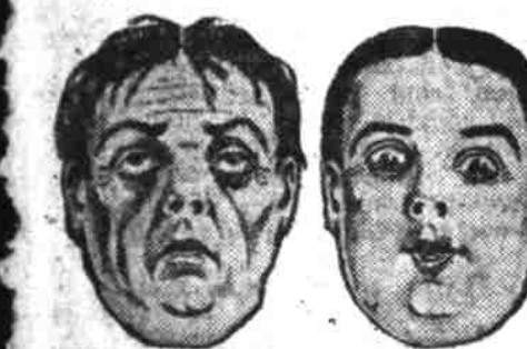
If You Want to Feel Good Try Kellogg's Sanitone Wafers.

and the owner had refused to sell. Be master of yourself; get that cheerfulness, poise and power that come from steady nerves in a vitalized body and brain. Kellower's Hearing of the charges against the Elgin board of trade, which is accused of violating the anti-trust laws, was body and brain. Kellogg's Sanitone Wafers' dispel that "down and out" feeling-fill you full of ambition and continued before United States Judge Landis at Chicago. Government contends the board fixes the prices of energy-make your 'winter of life' seem like spring. butter, by various devices. The Pennsylvania road dismissed