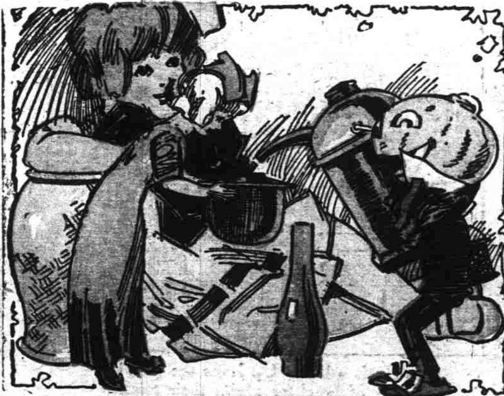
"How very good of you!" says Dot. "Don't mention it," says he