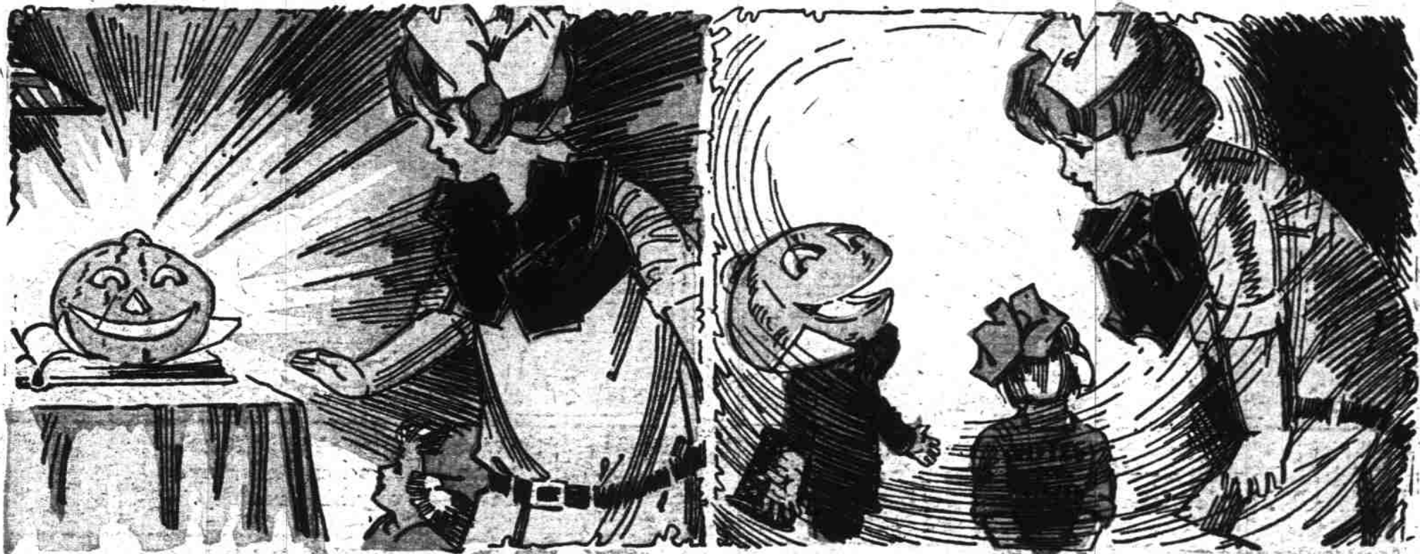
A sudden gleam lights up the room. She gasps, "Who is it, pray?"