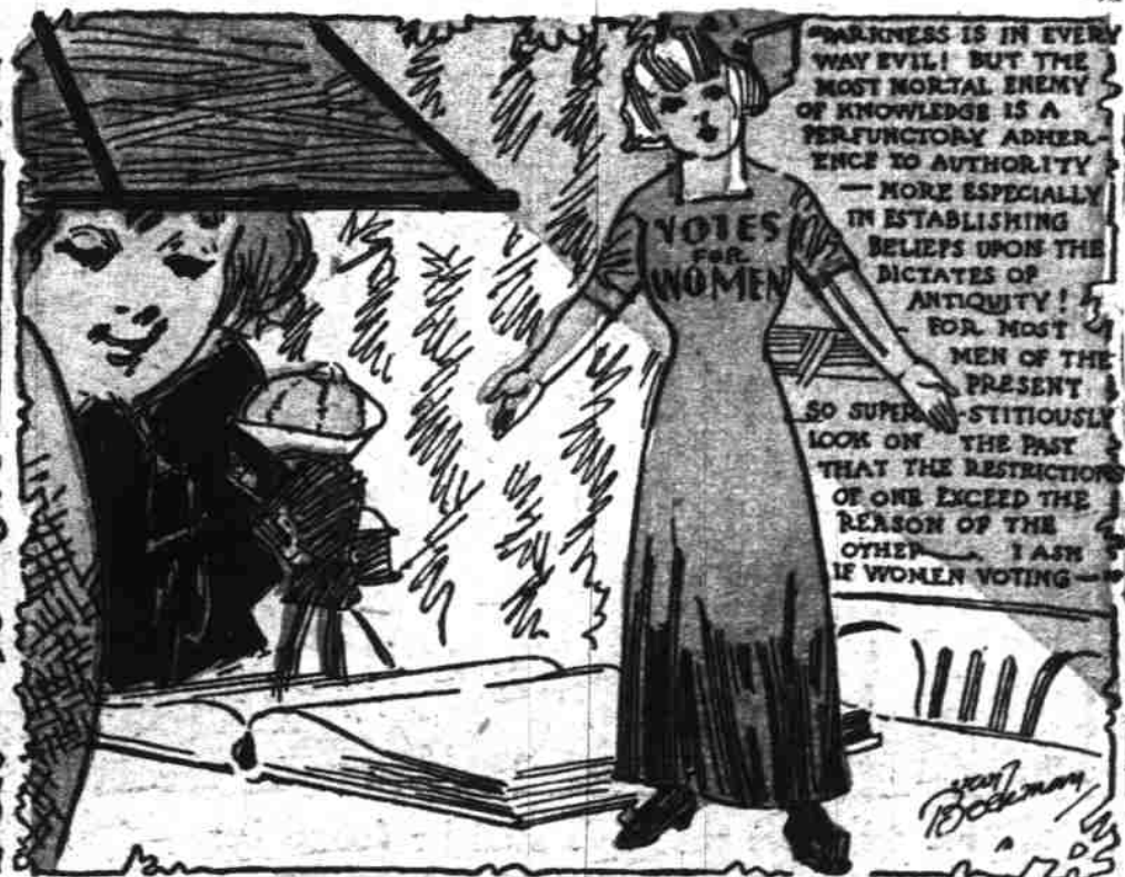
"When darkness falls across your path, smile, and it has to flee."

"DARKNESS IS IN EVERY WAY EVIL! BUT THE MOST MORTAL ENEMY OF KNOWLEDGE IS A PERFUNCTORY ADHERENCE TO AUTHORITY - MORE ESPECIALLY IN ESTABLISHING BELIEFS UPON THE DICTATES OF ANTIQUITY! FOR MOST MEN OF THE PRESENT SO SUPERSTITIOUSLY LOOK ON THE PAST THAT THE RESTRICTIONS OF ONE EXCEED THE REASON OF THE OTHER. I ASK IF WOMEN VOTING"