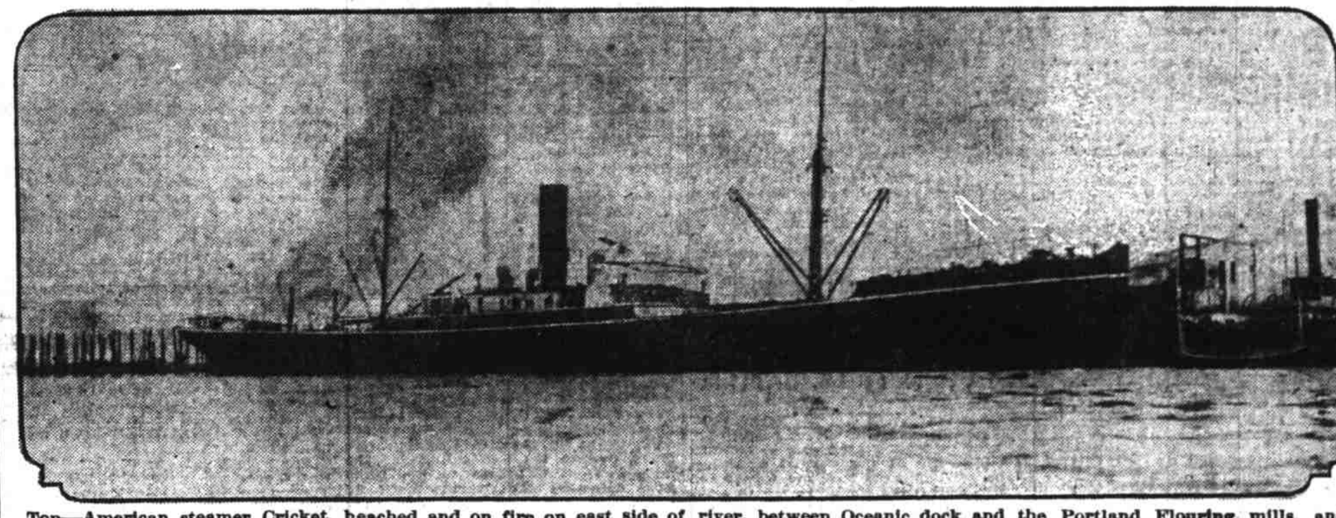
Top—American steamer Cricket, beached and on fire on east side of river, between Oceanic dock and the Portland Flouring mills, and fire boat, David Campbell, in action. Bottom—British steamer Glenroy of Royal Mail line, at ruins of Columbia Dock No. 2.

San Francisco, March 12.—"Not a lawyer in this town knows how to examine witnesses in the probate department," complained Superior Judge Coffey from the bench today.