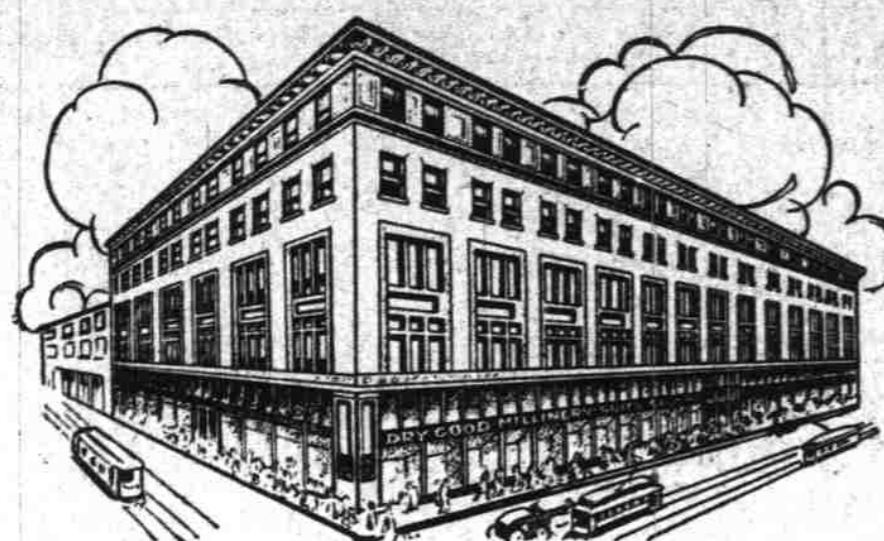
Meier & Frank's five-story building at Fifth, Alder and Morrison streets, built in 1890, to be torn down immediately, to make room for new 12-story structure.

Samples of Barley Requested. The Portland Chamber of Commerce has received a cable from the Liverpool and London Corn Trade association asking for samples of native brewing barley, for which the Portland chamber establishes international standards each year for the entire Pacific northwest.