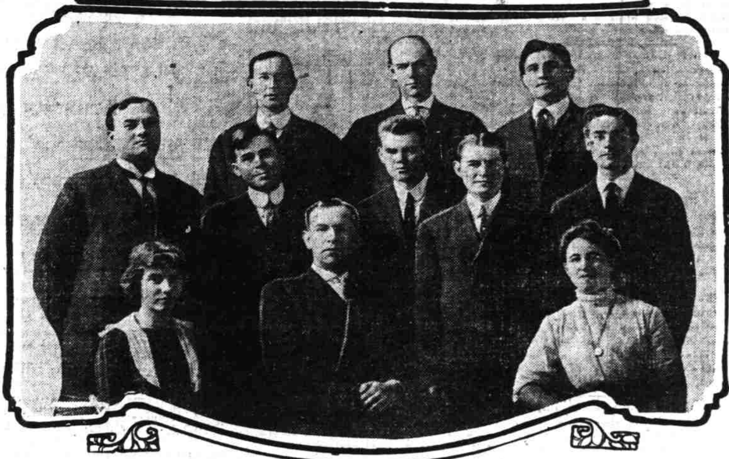
Chairmen of convention committees.

(Special to The Journal.) Albany, Or., Feb. 21.—Two hundred and fifty delegates from all parts of the state had registered attendance at the twenty-fourth annual state convention of the Christian Endeavor association which convened here yesterday afternoon at 3 o'clock in the First Presbyterian church. By today noon the total number of delegates is expected to reach 300. The convention will close Sunday evening and it is believed that the city will be the greatest in the history of the state. All of the delegates are being entertained in private homes of the convention during the three days of the convention. Registering of delegates started early yesterday morning as every train bore a delegation. When the convention assembled the various delegates were assigned to various homes after which an informal social gathering took place. This was followed by a song and devotional service.