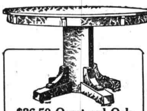
$26.50 Quartered Oak Dining Table $14.85

A Number of Odd Arm Chairs Are Entered at 1/2 Price