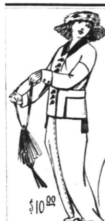
Smart Broadcloth Suit—only $10.00—like illustration, in wine color, trimmings of black plush and jet buttons. Lined with satin.

Meier & Frank Co. 1867 1914 THE QUALITY STORE OF PORTLAND Fifth, Sixth, Morrison, Alder Sts.