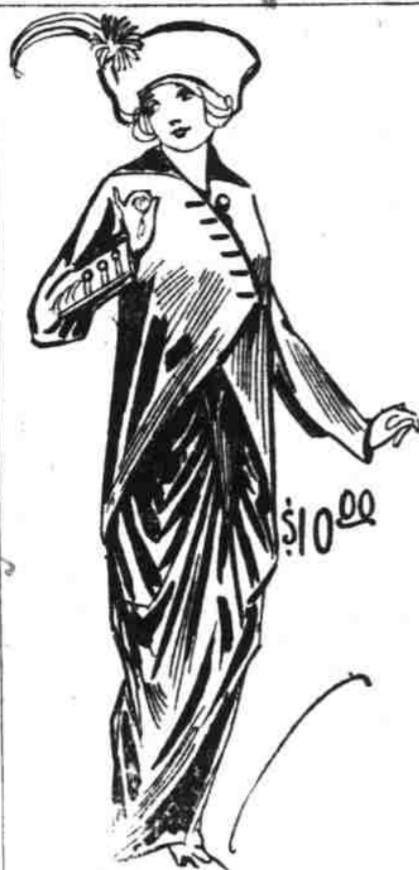
Burgundy Velvet Suit, $10—sketched in our Garment Salons. Lined with self-toned satin, trimmed with velvet buttons. Newest model.

Store Opens at 9 A. M., Closes at 6 P. M., Including Saturday