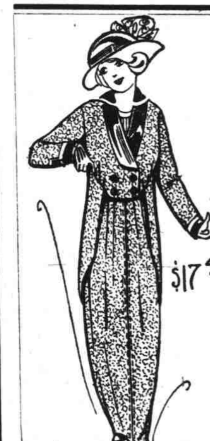
This Suit $17.45—sketched in our Garment Salons. Beautiful soft brocade, in plum shade. Self-toned velvet trimmed—lined with satin.

Women's and Misses' $20 to $35 Suits Pre-Inventory Sale Price Only $10.00