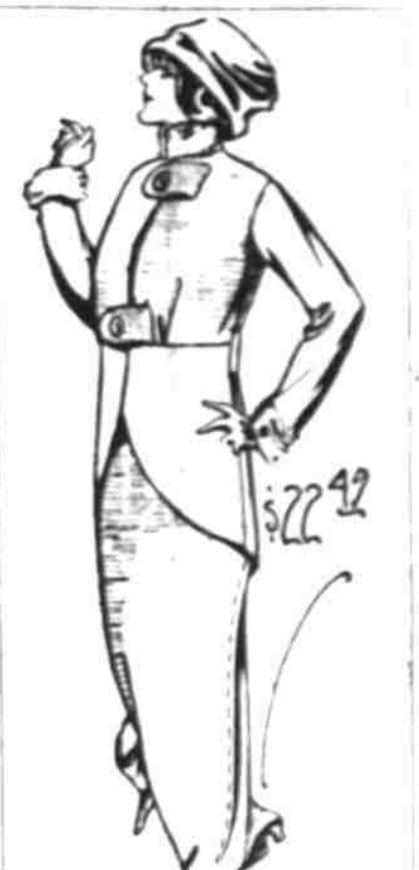
$55 Novelty Suit, reduced to $22.45—sketched from model in our Garment Salons. Burnt Rose Whipcord, military collar and cuffs of white caracul fur, lined with white satin.

2400 to be closed out at this price—a good assortment of attractive patterns. Big Basement Store