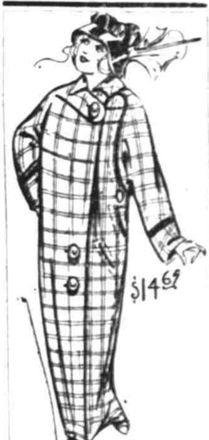
Beautiful novelty Coat reduced to $14.65—formerly $35. Handsome plaid material, contrasting pipings and collar—lined with satin.