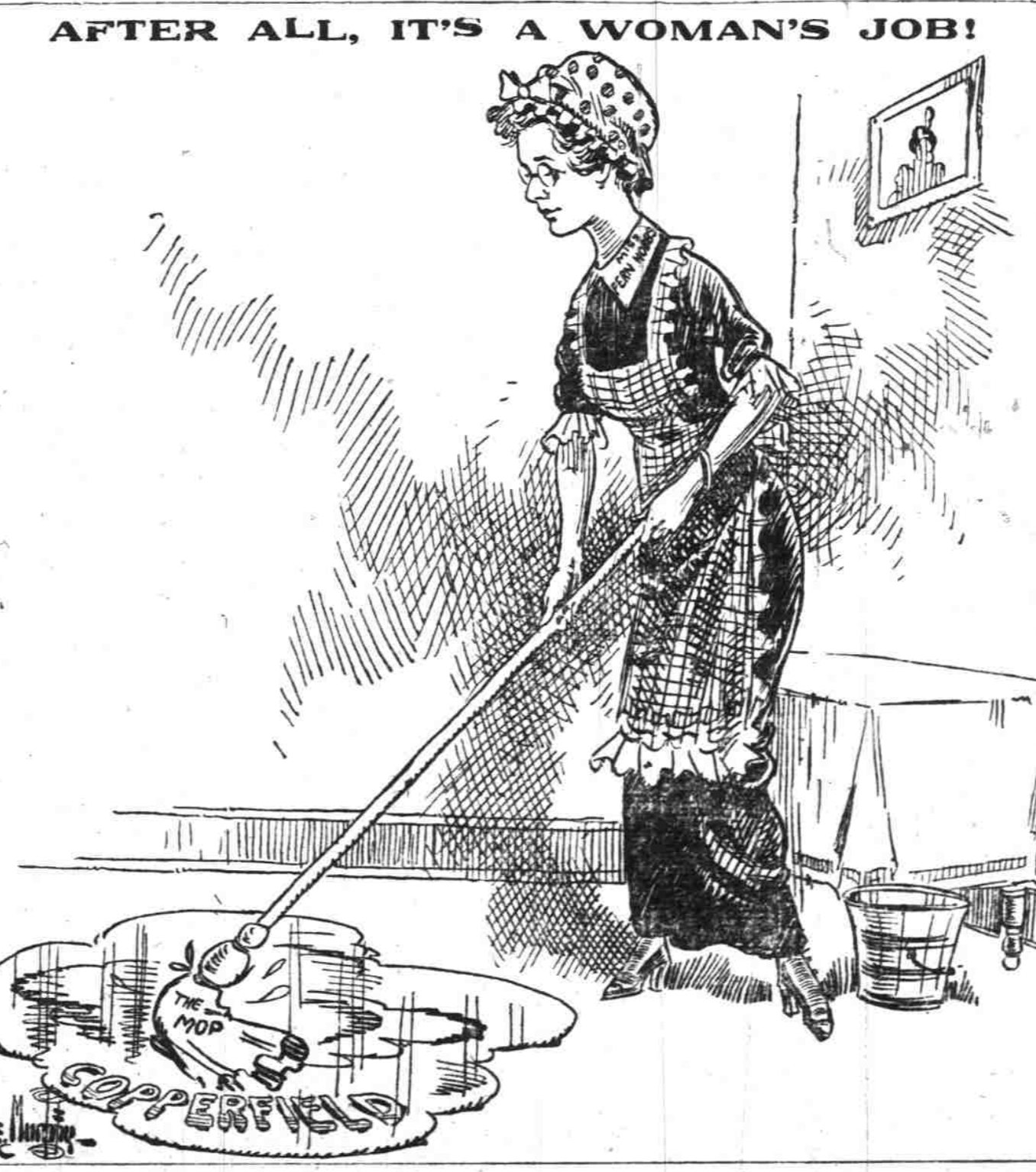
AFTER ALL, IT'S A WOMAN'S JOB!