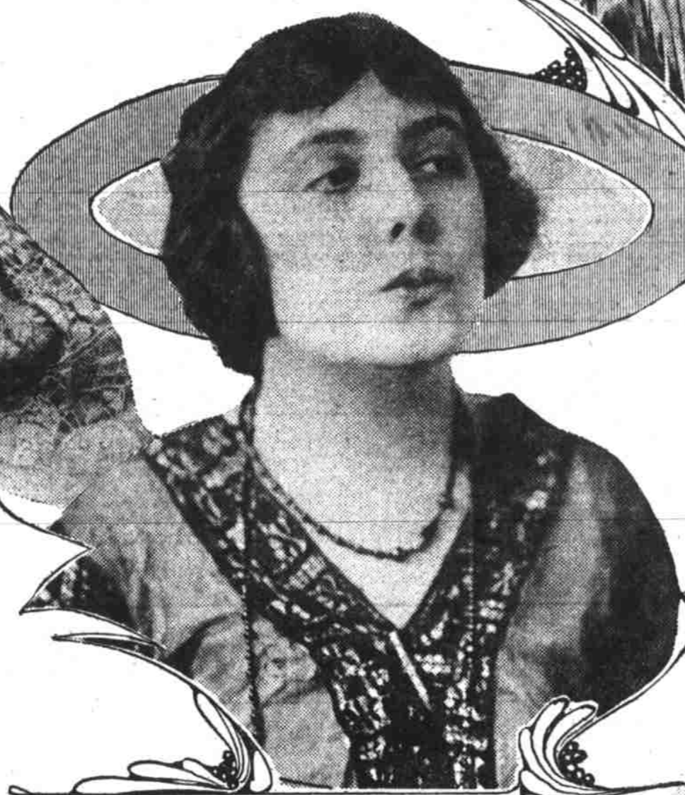
Lift Your Head and Blow at a Bit of Imaginary Thistle-down, Keeping the Chin in the Air for Five Minutes. Supposing the Thistle-down to Be First on One Side of You, and Then, on the Other!

feel stretched and drawn out flat. With the chin still kept on the stretch, turn the head first to the right and then to the left. This exercise, if persisted in, will surely give firmness and symmetry to the chin. After practicing it the muscles of the chin will feel sore, but that shows the effectiveness of the movements and that the muscles are getting the needed exercise. The simple means by which I have kept the contour