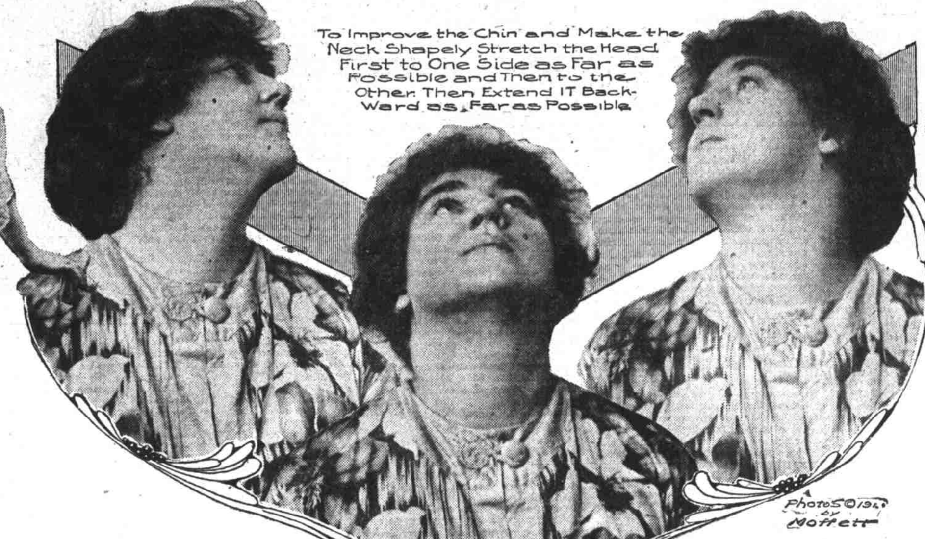
To Improve the Chin and Make the Neck Shapely Stretch the Head First to One Side as Far as Possible and Then to the Other. Then Extend It Backward as Far as Possible.

As a substitute for these natural movements a series of exercises can be used which are easy and effective in banishing the heavy chin. The first of these is to throw the head back as far as possible, thrusting out the under jaw at the same time so the whole chin will