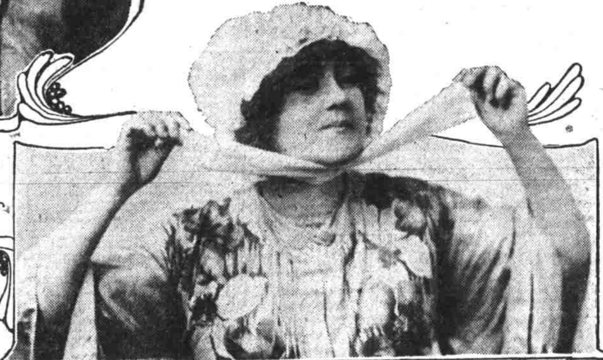
Wear a Reducing Chin Bandage at Night

The chin can be reduced by using strips of rubber