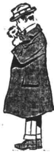
Men's Store, Third Floor, New Building

Splendid Ribbed Wool Union Suits, in a medium weight and in natural gray color. Very warm and comfortable. Specially reduced from $2.50 to, the suit... $1.98 —Meier & Frank's—Just Inside Alder Street Entrance.