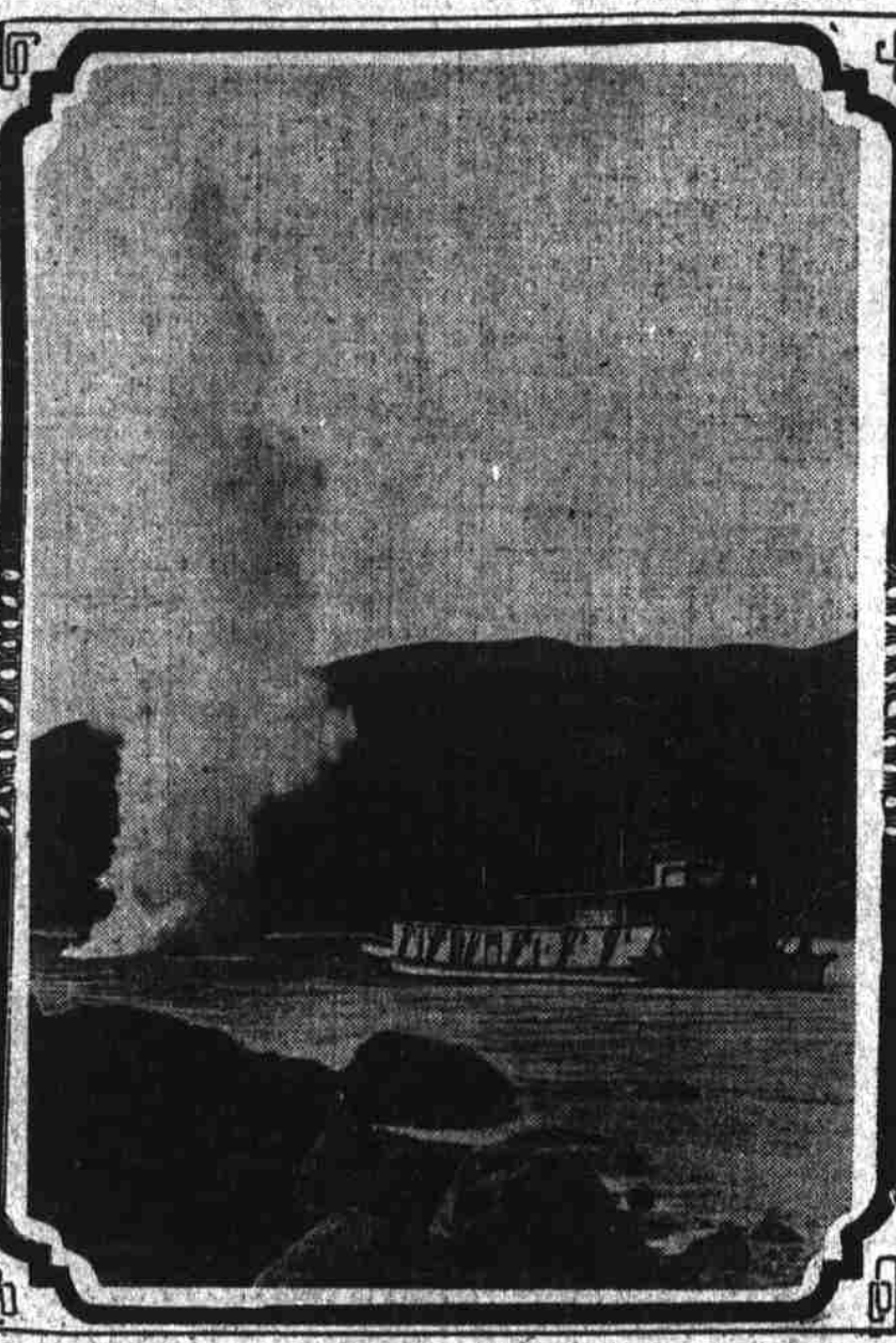
Menace to navigation removed by the United States steamer Umattilla, shown in foreground.

By the blowing out by dynamite of a rock in the channel of the Columbia river three miles above Arlington, the United States government has removed another menace to navigation in the stream. The blast was put in at McCarthy's shoal. The rock was covered with only a foot of water at low tide, and was considered by navigators as a