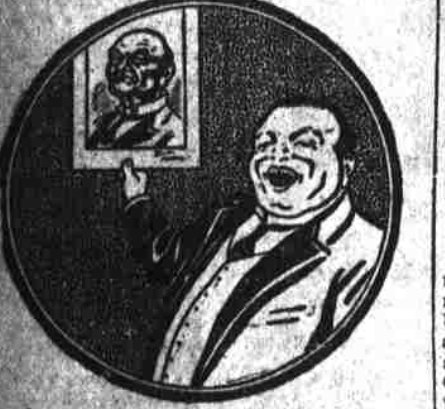
"That's the Way I Used to Look. What do you think of me now?"

It is a Sure Sign Your Stomach is Able to Work. Stuart's Dyspepsia Tablets Will Give You a Rousing Appetite. It is the greatest joy in the world to be able to eat what one wants and no misery can compare with that which comes when an appetite falls. When the stomach cannot digest food the system revolts at the very idea of eating, but when the digestive apparatus is restored to its normal condition every quality of mind seems to make a man cheerful.