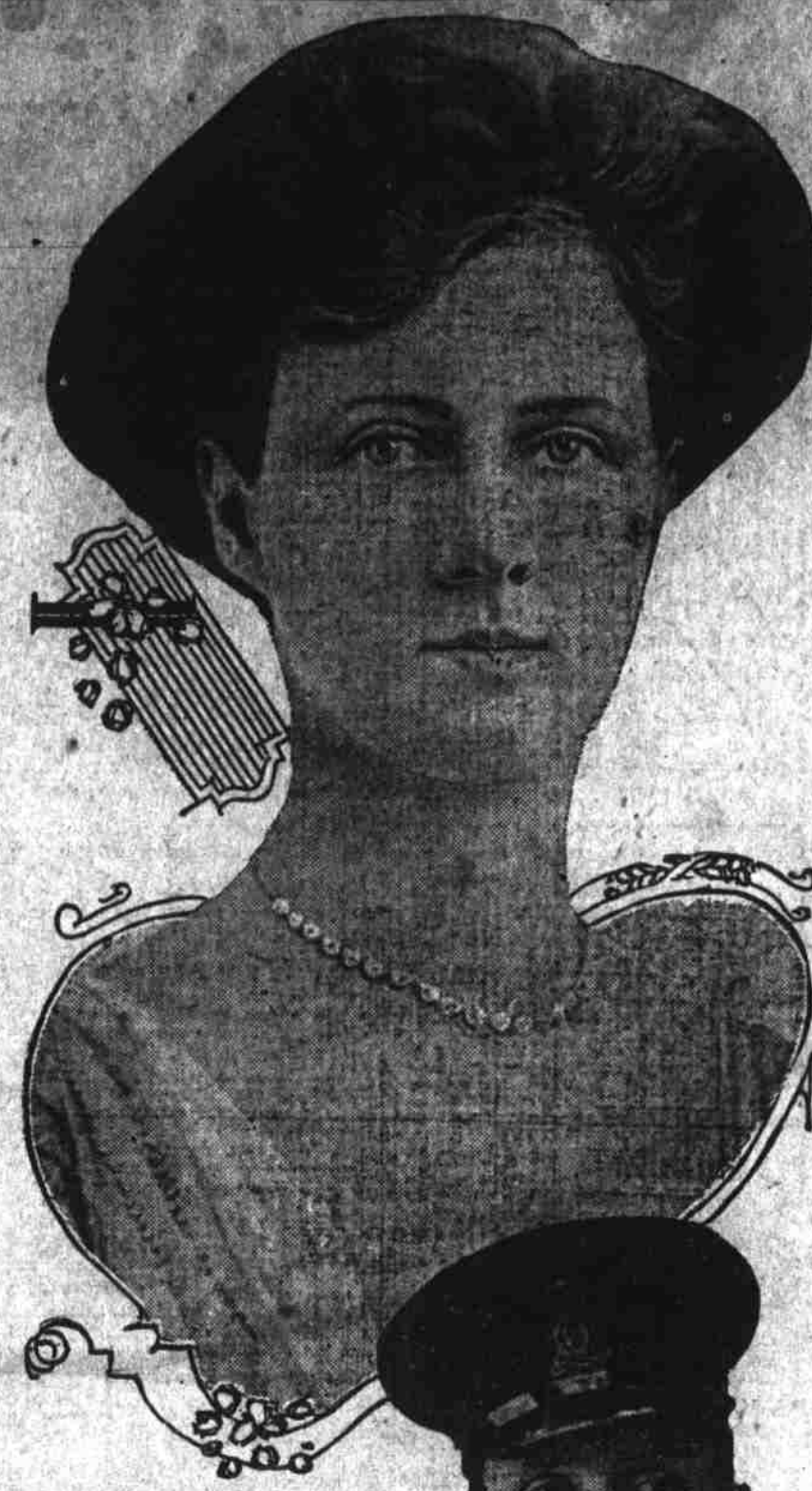
Duchess of Fife and Prince Arthur of Connaught. Prince Arthur is a nephew of the late King Edward, and the Duchess is the eldest granddaughter of the late king.