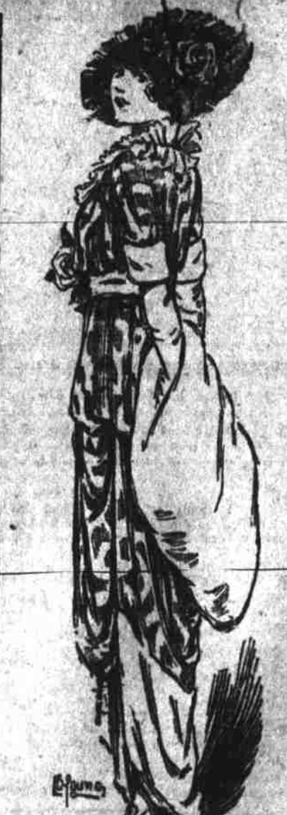
The winter calling gowns are softly graceful.