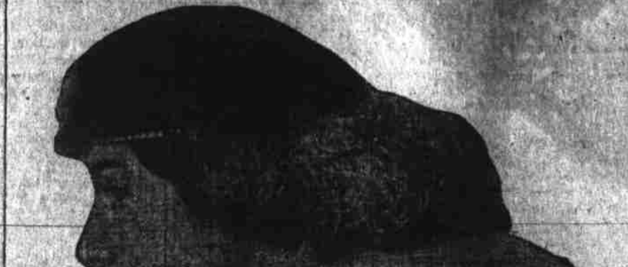
Marjory Pearson makes her own face creams.