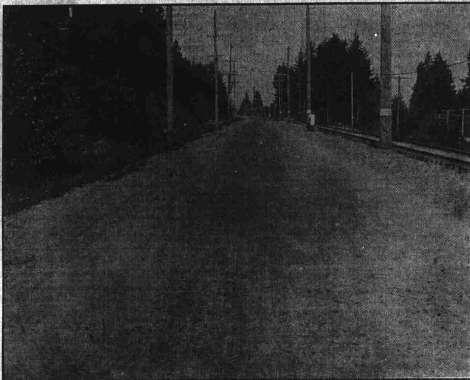
THE FIRST HARD-SURFACE ROAD LAID IN OREGON THE LINNTON ROAD, MULTNOMAH COUNTY, PAVED WITH WARRENITE

WARRENITE, in modified form, is constructed under the same general principles, supervision and care as the Bitulithic street pavement, the growth of which has been unprecedented in the paving world. WARRENITE is especially adapted for the surfacing of country highways subjected to the ravages of automobile traffic.