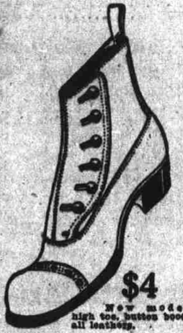
$4 New model high toe, button boot, all leathers.

Bear in mind that there are now THREE Baker stores in Portland. You are most cordially invited to visit the one most convenient for you and become acquainted with the Baker Shoes and Baker Service. We predict that both will please you.