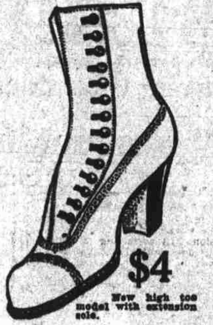
$4 New high toe model with extension sole.

O UR EVER INCREASING BUSINESS in Portland has made it necessary for us to establish another Baker Shoe Store that we may serve you better. This new Baker Store (the ninth on the coast) adds another strong link to the great chain of Baker Stores; another powerful unit to our already great buying strength; another intrenchment to our now impregnable position as the largest retail shoe concern west of Chicago.