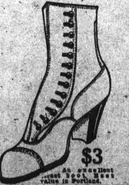
$3 An excellent street shoe, best value in Portland.

380 Washington St., Corner West Park 270 Washington Street 270 Morrison Street