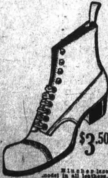
$3.50 With cap last model in all leathers.

Largest Retailer of Shoes West of Chicago