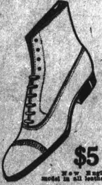
$5 New English model in all leathers.