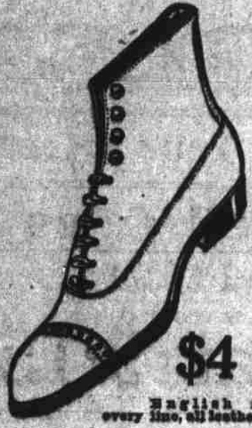
$4 English in every line, all leathers.

Will Open Tomorrow Morning at 380 Washington St., Cor. W. Park