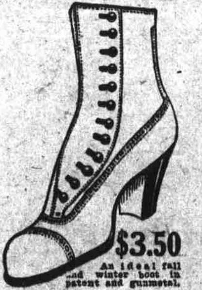
$3.50 An ideal fall and winter boot in patent and gunmetal.

Agency Nettleton Shoes—Best of the Good Ones—for Men