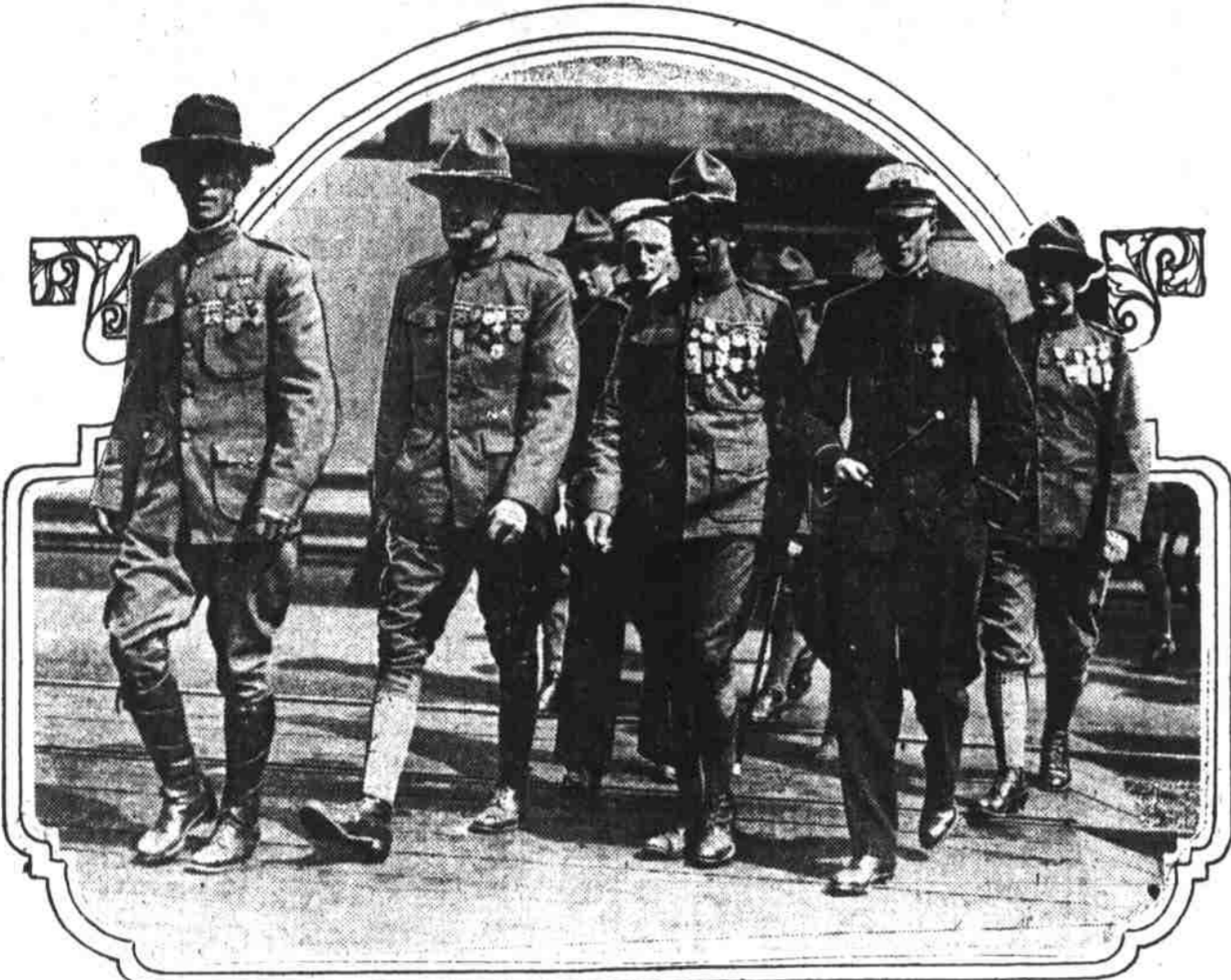
Militiamen as they appeared on arrival in Portland, after gaining laurels in competition with nation's best rifle shots.