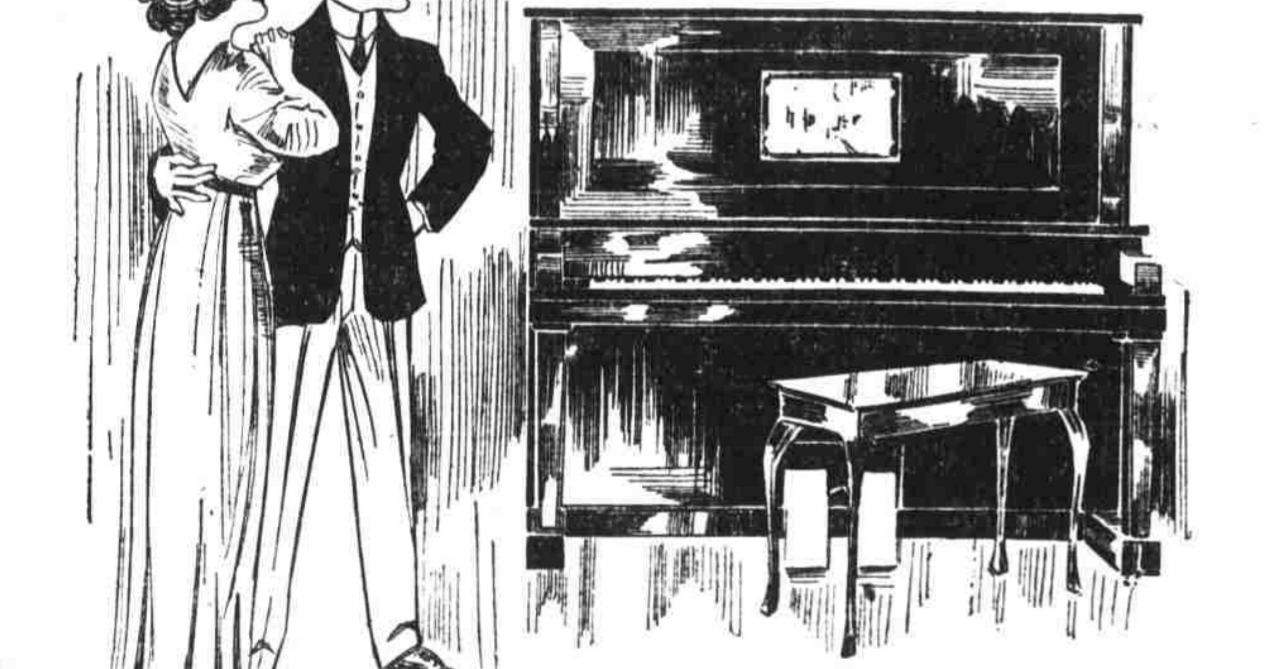
THE PIANO ANYONE CAN PLAY

THE PLAYER PIANO IS THE MOST IMPORTANT PURCHASE FOR YOUR HOME The ease of operation of the new improved Player Pianos is delightful—the expression and delicacy of tone color as produced by the new, up-to-date Player Piano makes it the ideal piano for the family's entertainment—for the family's broad musical education. Come and play it yourself—thus realizing the artistic rendition and interpretation possible with this Player Piano from the very time of your purchase. This is the first and only opportunity for every home to purchase a new, latest improved Player Piano at the price other dealers ask for used and unimproved ones—think of saving $285—this saving of 38 per cent dispels indecision—come today—don't delay—get first choice—for there is a choice of tone in even the same style and make—there is the choice of individuality of tone—full—mellow—free-singing quality—the kind you love so much.