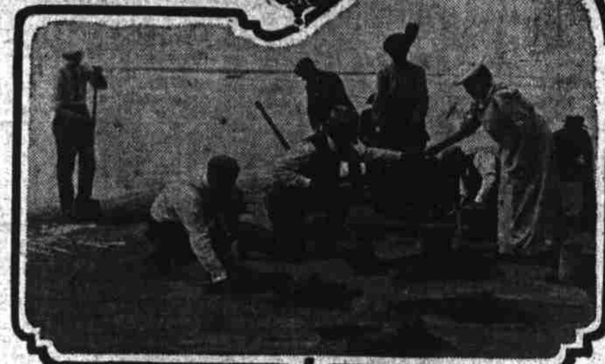
Scenes typical of North Beach. Cottage shown in picture was made out of beach driftwood. Party of clam diggers is shown.

"When one considers the significance of food and its relation to the efficiency and comfort of the human body, the importance of the knowledge of food values and the preparation of the food becomes apparent." It is advised that