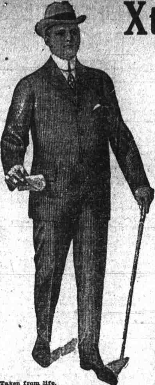
Taken from life.