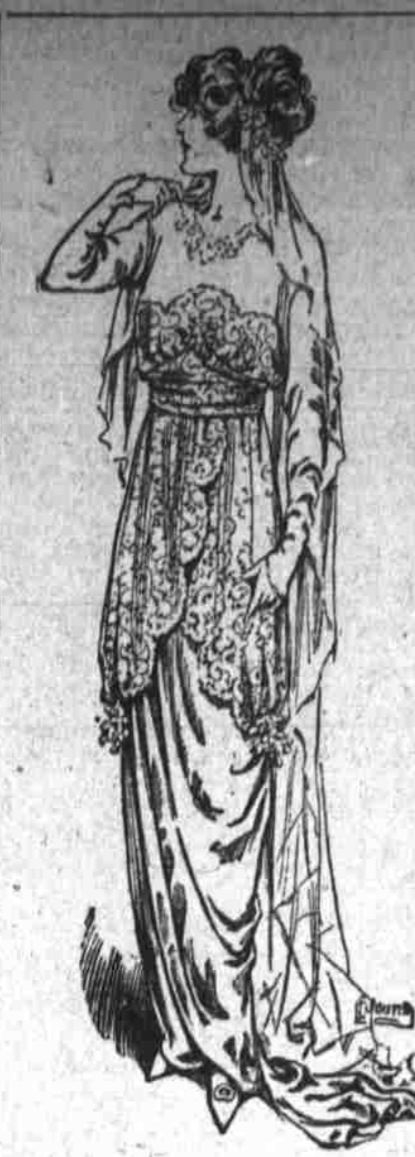
Summer Bridal Gown of Crepe Meteor and Duchess Lace.

June and July bring the bridal finery—finer than ever this season—and the bride herself, all in misty white. Today's sketch shows a handsome gown of ivory white crepe meteor for the summer bride, which with a little altering will serve later for an evening gown.