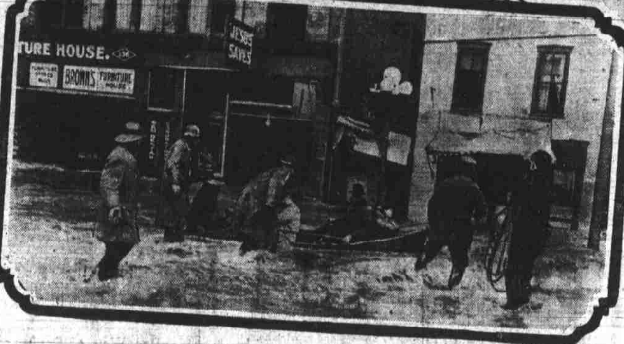
Top—Fifth street, Dayton, Ohio, covered with water; saving old lady and son who had been marooned for three days. Bottom—Rescuers at work in Fifth street in the swift current.

(United Press Leased Wire.) Washington, April 2.—President Wilson explained his views on tariff revision to the House ways and means committee today. He told Chairman Oscar Underwood that the free list does not mention foodstuffs, and he insisted that the committee immediately arrange to admit such commodities free.