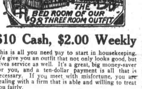
THE BED ROOM OF OUR $98 THREE ROOM OUTFIT

Here are reasons why Edwards' prices are so much lower than others.