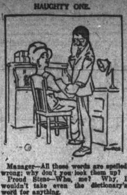
Manager—All these words are spelled wrong; why don't you look them up? Proud Stone—Who, me? Why, I wouldn't take even the dictionary's word for anything.