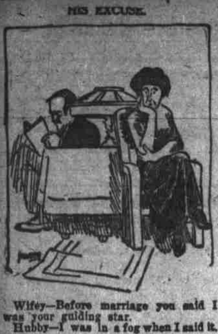
Wiley—Before marriage you said I was your guiding star. Hubby—I was in a fog when I said it.