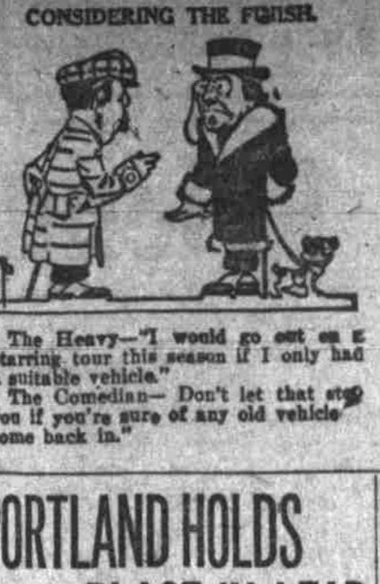
The Heavy—I would go out on a rafting tour this season if I only had a suitable vehicle. The Comedian—Don't let that stop you if you're sure of any old vehicle some back in.