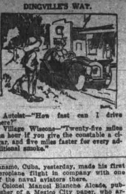
Autotest—How fast can I drive here? Village Wilsons—Twenty-five miles an hour if you give the constable a five and five miles faster for every additional smoke.