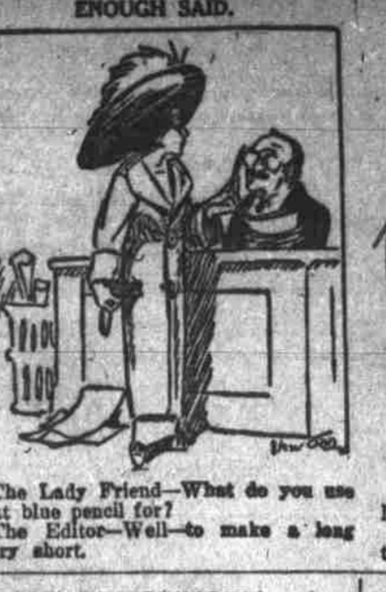
The Lady Friend—What do you use that blue pencil for? The Editor—Well—to make a long story short.