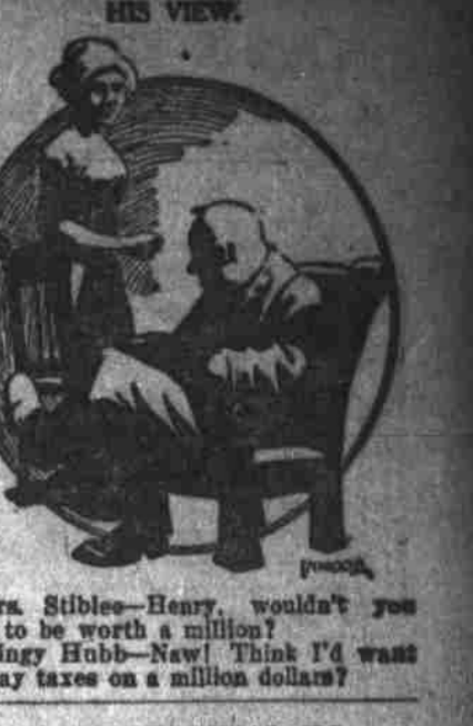
Mrs. Stibles—Henry wouldn't you like to be worth a million? Stingy Hubb—Now! Think I'd want to pay taxes on a million dollars?