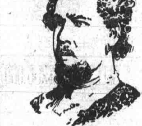
LEO SLEZAK Leo Slezak, famous for his singing of the title role in "Otello," says: "Tuxedo means tobacco superiority. It easily holds first place in my opinion on account of its wonderful mildness and fragrance."

The favorite tobacco of the world's best singers