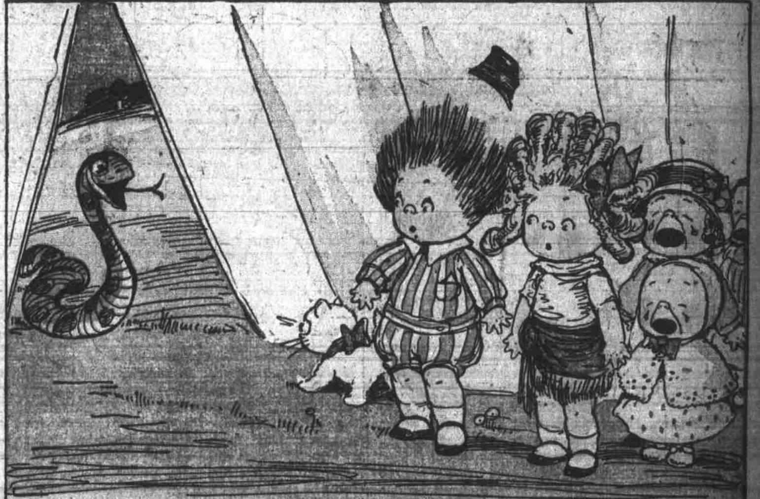
An' all the kiddies an' babies clapped—an'—an' Killarney Rosie was a fierce horribliferous jungle tagger cat an' we painted stripes on to her—an'—an' she gr-r-owed somepin horribliferous—an'—an' suddently a big—fierce rattleybang snake comed coilin' an'—coilin' long ther'.