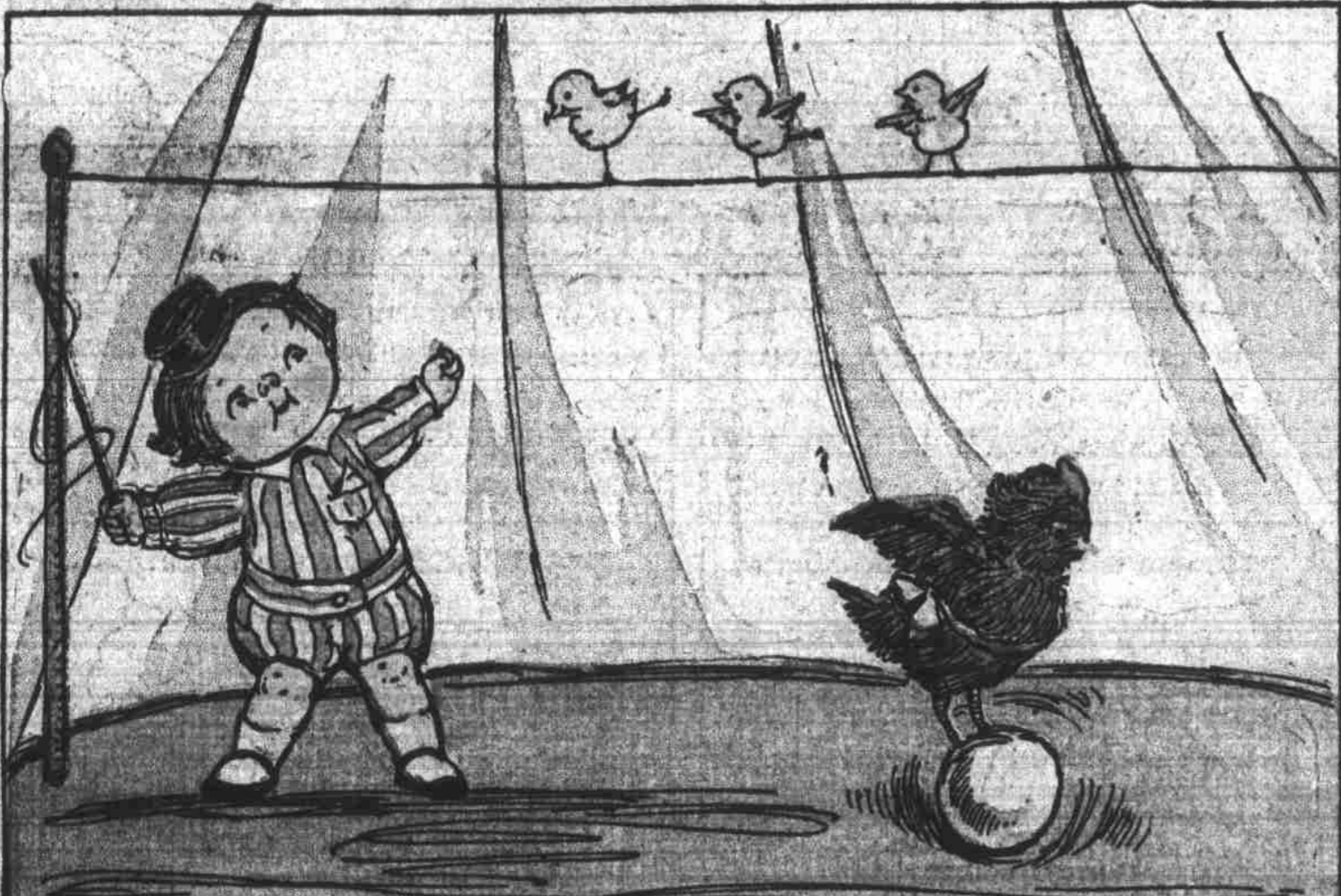
An' the 'ittle chickens had a trapeze—an' mine baby bruvver managed 'em, an' 'ey was splendiferous tight rope walkers—an'—an' actorbats—cause 'ey had winges to 'em so's 'ey could fly—an' the ol' gray hen—Misses Cockle-doo—she was the on' y livin' trained African ostrich.