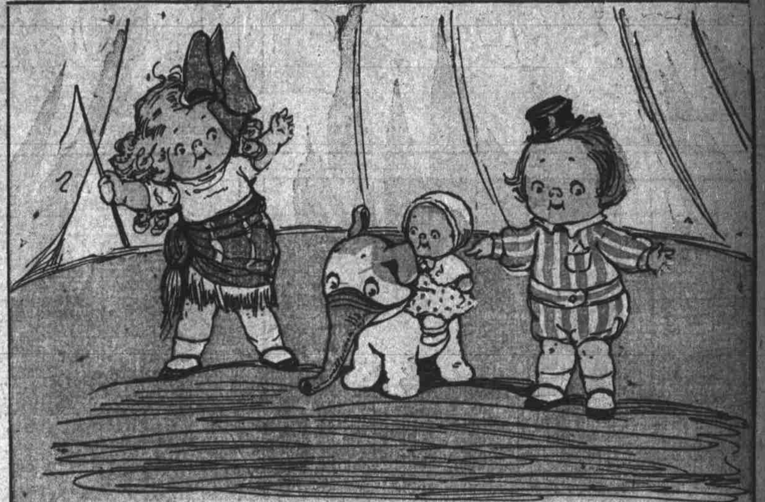
An' lots o' 'ittle boys an' girls an' babies comed—an' Puppo he was the eflunt wif a pretend trunk tied to his mouf—an' a "How-de-do-dah" on his back—an' the 'ittlest babies taked a ride on the eflunt for two-pins 'xtra—an' Gwendylin 'Vangeline May was the eflunt's keeper—an'—an' Puppo was a magniferous eflunt.