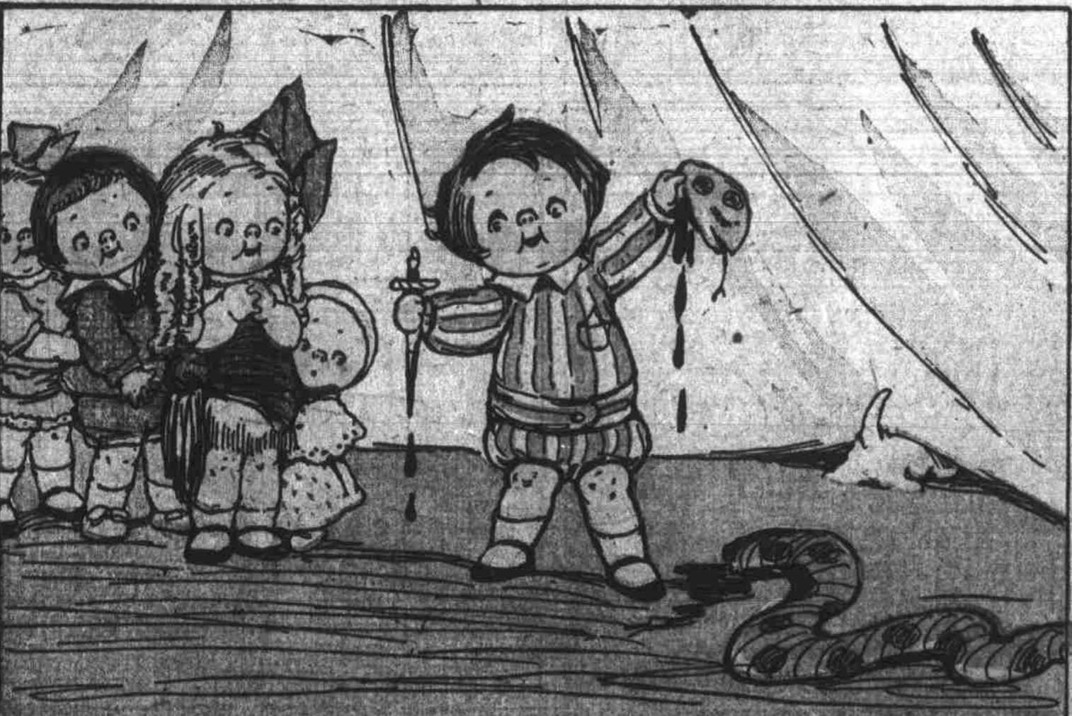
O An'—an' eve'buddy was orful scared but me—'course I wasn't not—I jus'—er—I jus' taked mine pistol an' shooted him full o' holes, 'en I taked mine dagger a n'—an' I cutted his hed orf an' all o' the peoples at the circus sed I was a moe' magniferous hero what never was.