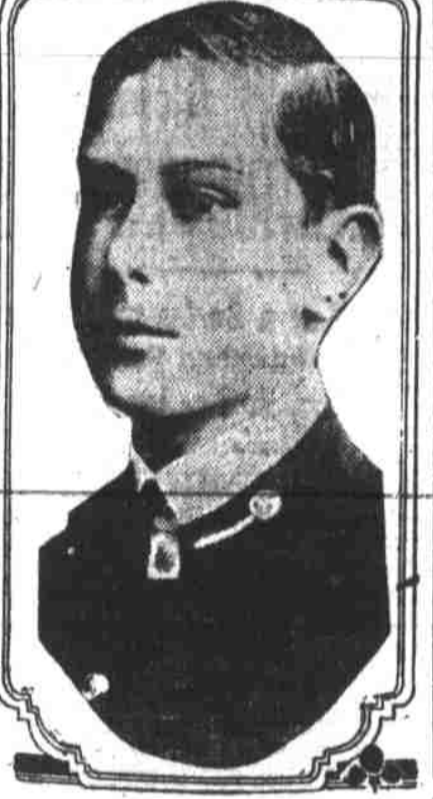
Prince Albert of England.

his eighteenth year. He entered the Royal Naval College four years ago and proved an enthusiastic and diligent student. Two years were spent at Osborne, where he went through the initial stages of engineering, with workshop practice, seamanship, navigation and the usual curriculum of the public school. He fared in exactly the same way as other cadets, with the same hours of study, the same food and accommodation, and like the other boys, with one shilling as pocket money and no luck shop account allowed.