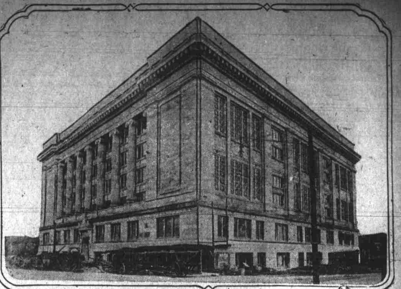
First view of Multnomah county courthouse taken since scaffolding was removed. Practically all the work on the exterior of the new courthouse has been completed, nothing now remaining to be done except to clean the walls and remove the debris. Remarkably fast work has been done on this structure in the past year, for nothing but the east end of the building was erected in January, 1912. The interior work is being rushed and part of the new section will be completed this month.