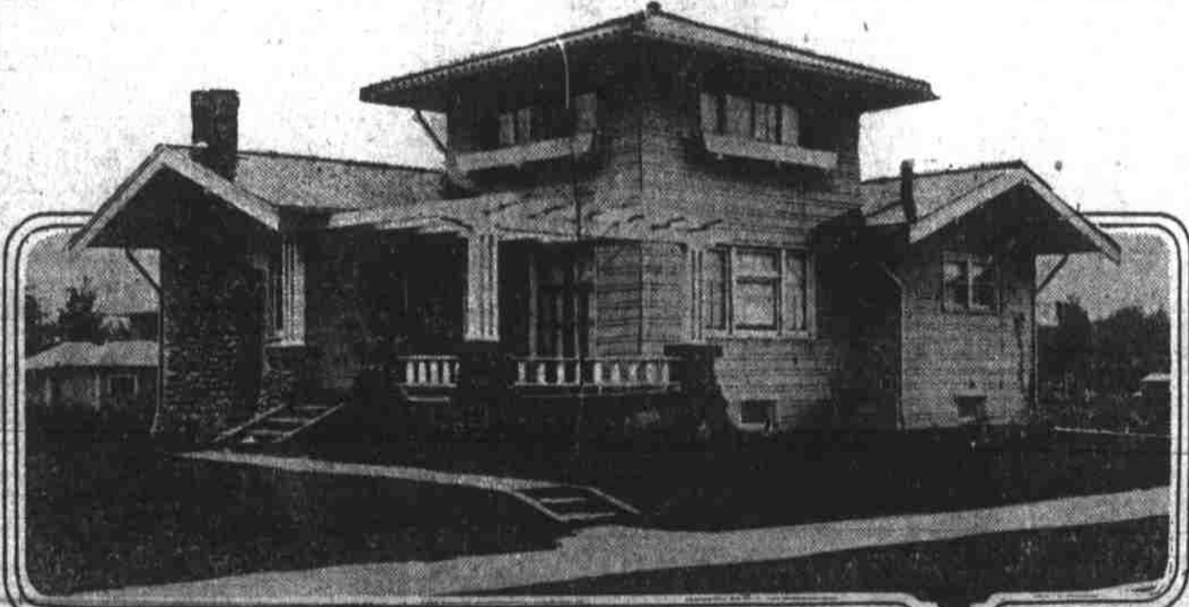
Home of H. O'Melvin, recently completed at 1172 East Tillamook street. This is of a picturesque type that is becoming popular throughout the city. The structure is roomy and comfortable and is modern in every respect.