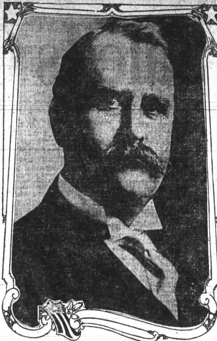
Eugene N. Foss, Democrat.