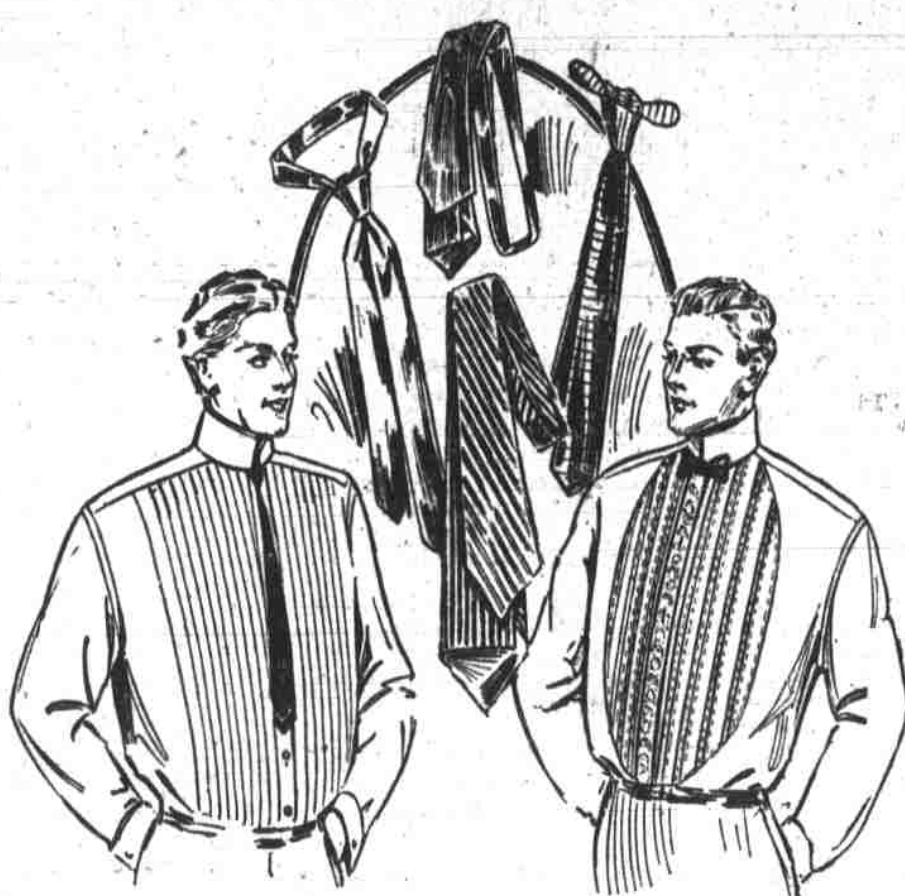
See the Morrison Street Window Display.

Immense Special Purchase Men's White Shirts, $1.50 Grades, on Sale at Only