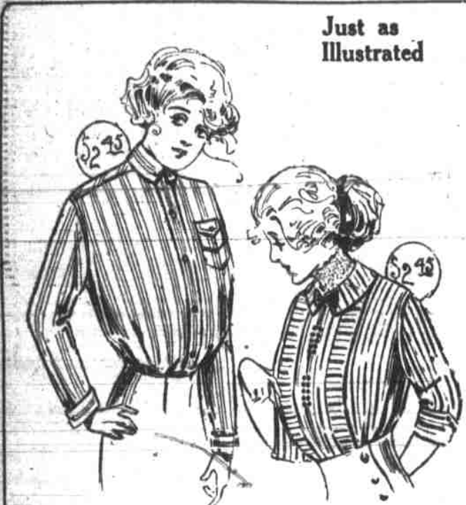
Just as Illustrated

SWITCHES that you couldn't buy elsewhere even at our regular price $7.50. And we special them tomorrow at $4.98. Of fine quality German wavy hair—they'll help wonderfully in the added attractiveness of madame's coiffure. $7.50 $4.98 Switches at $2.50 Switches—of fine quality German hair. Full 22 inches long. Special only $1.49 $12 Switches—of fine German wavy hair. Made in three separate stems, which women know is a most desirable feature. $6.98 Full 34 inches long. Sale $6.98