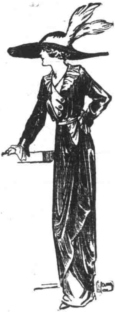
Several strikingly new features are introduced in this model.

GRAYS are particularly good fall fall, especially the taupe shades, that hint of pink and brown, and the smoke hues, that are so becoming to women who have clear complexions.