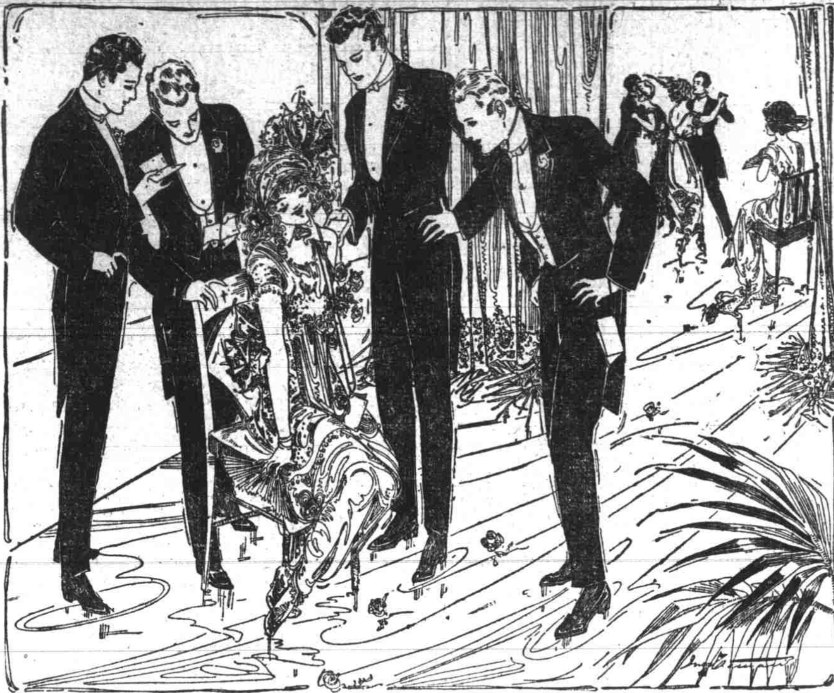
At the club ball Sweet Sixteen becomes a bit confused when so many admirers clamor for her dance program.