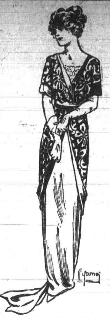
One of the most effective black and white costumes of the season.