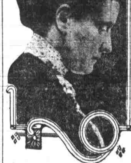
Miss Jane Addams of Hull House, Chicago.

(United Press Leased Wire.) Chicago, Aug. 7.—The stand of Jane Addams, of Hull House, last night in reopening the negro problem, today has put that question up to the progressive delegates. It was believed by the leaders that Colonel Roosevelt disposed of the matter in his "confession of faith" speech to the convention yesterday, and Miss Addams caused consternation by reopening the question. Miss Addams insists that a plank declaring for white leadership in the south be inserted, with a promise of political equality and a fraternal welcome to the new party. Gifford Pinchot and other leaders close to Roosevelt are against such a radical plank, but Miss Addams announced today her determination to stand pat on the negro issue and a bitter debate is expected on the convention floor as a result.