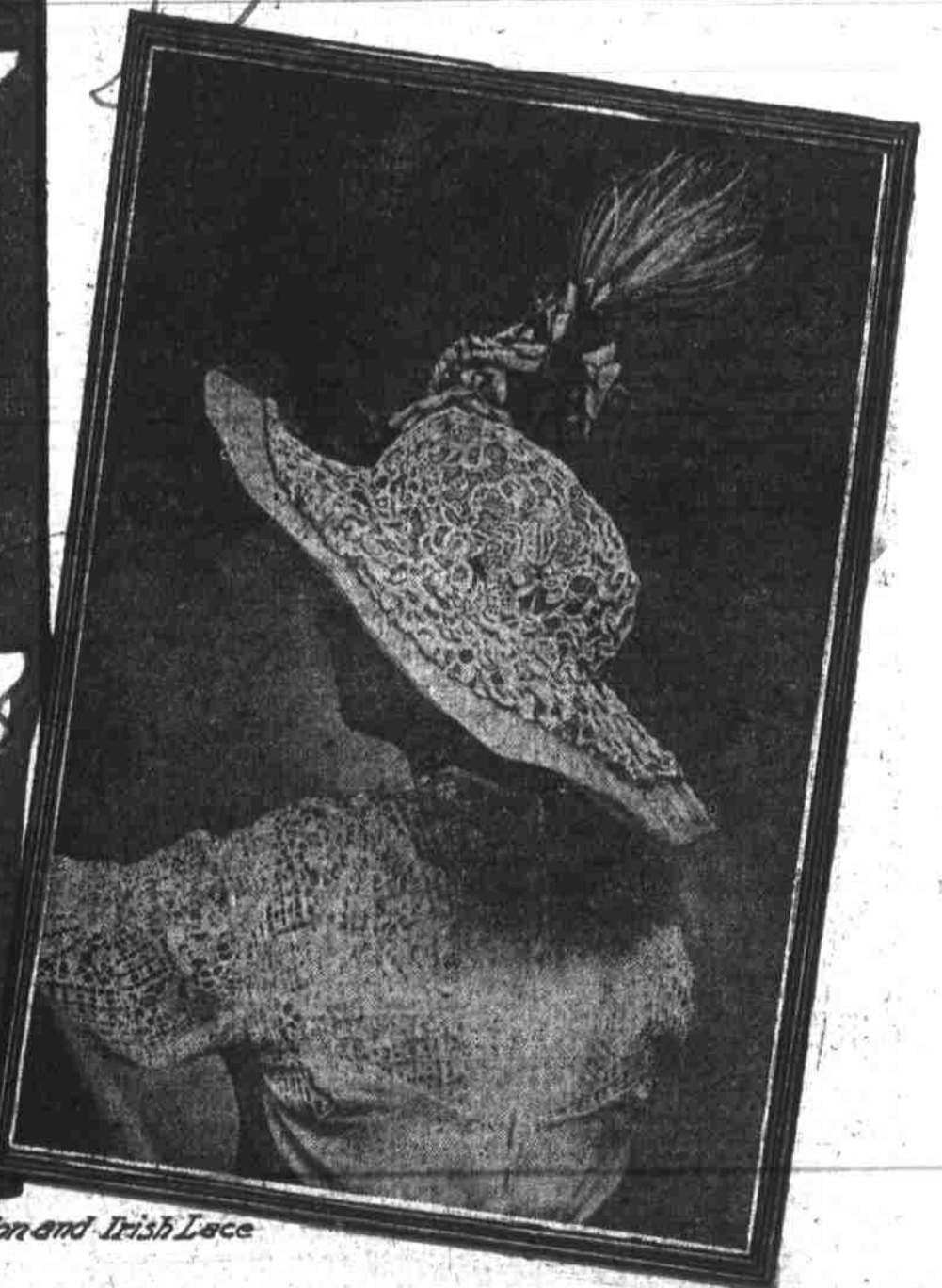
Chiffon and Irish Lace