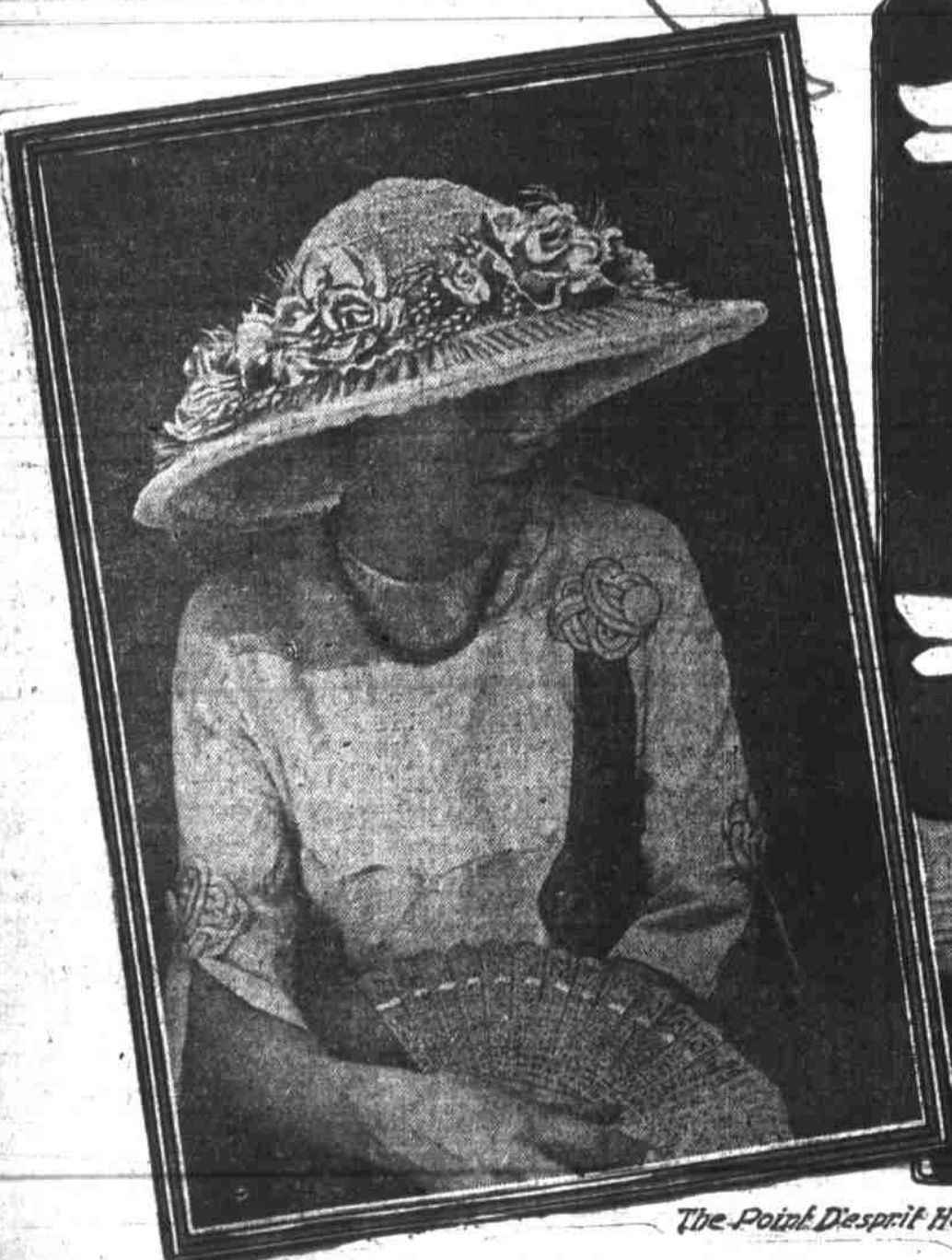
The Point D'esprit Hat