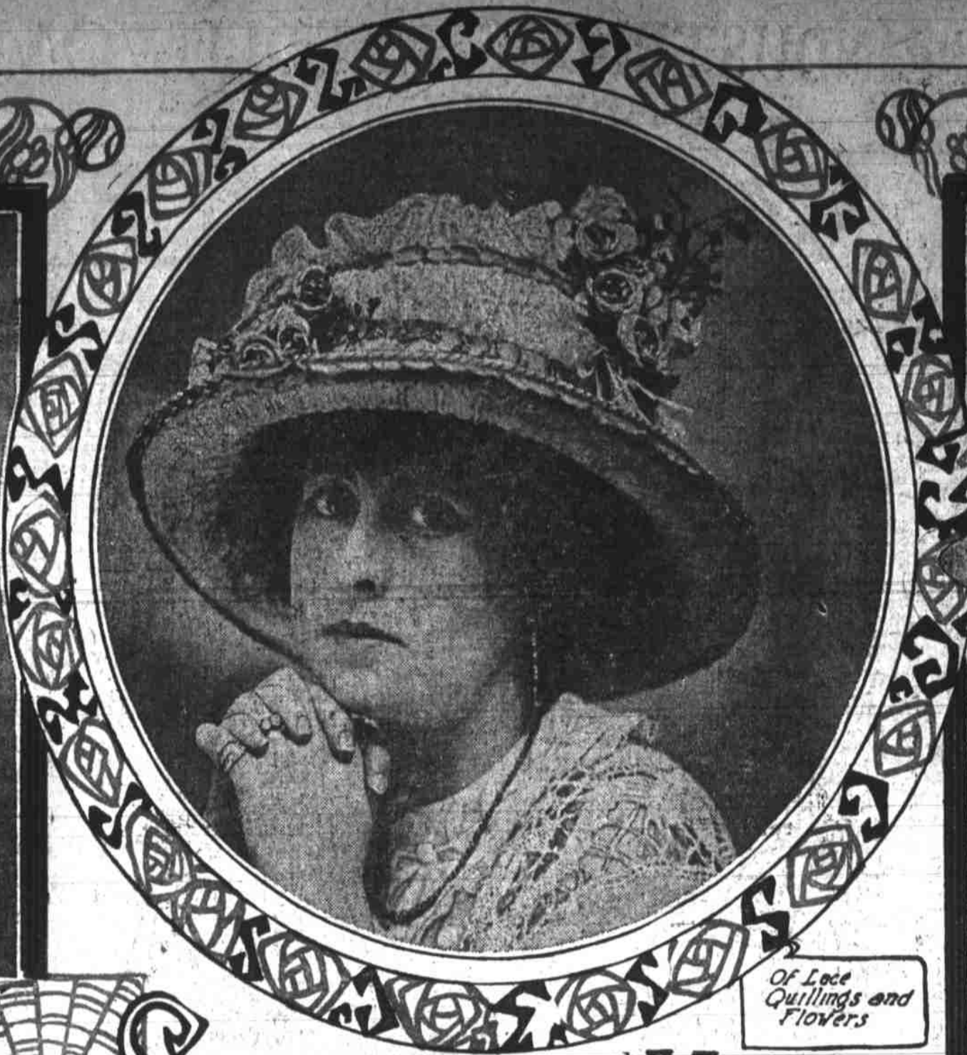
Of Lace Quillings and Flowers