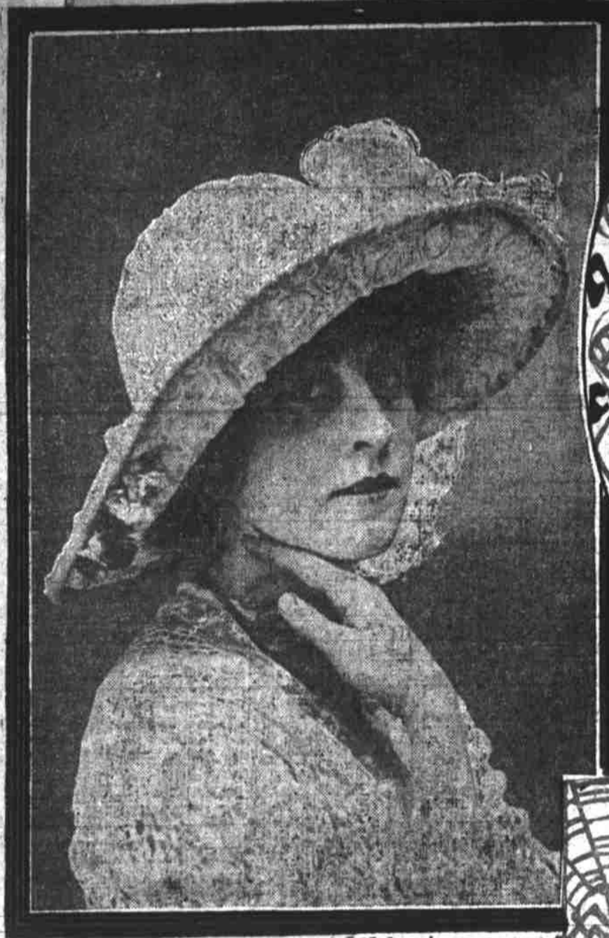
Valenciennes over Mousseline