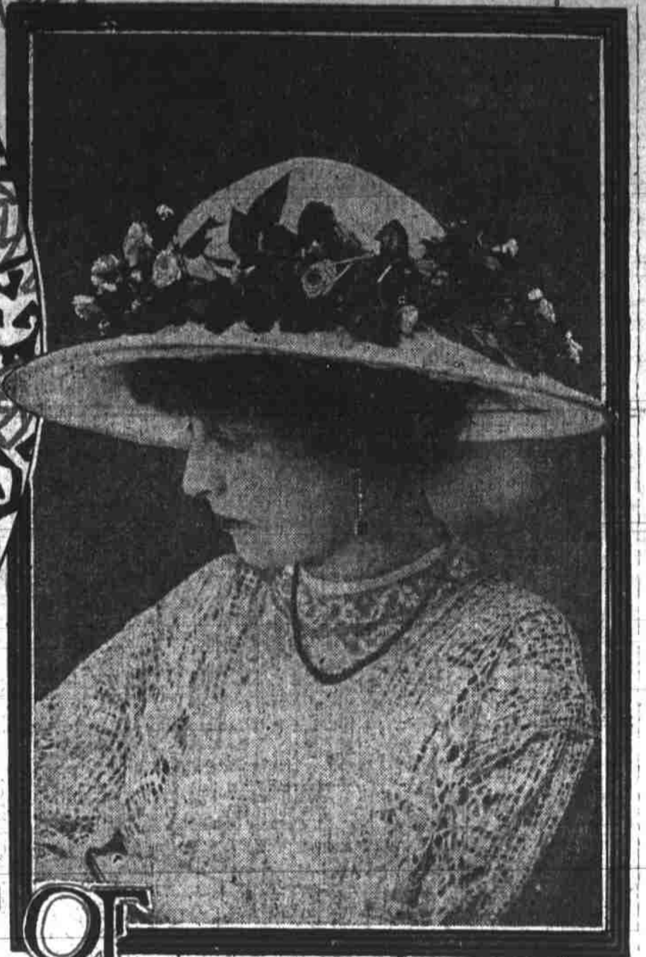
Fishnet and Rosebuds