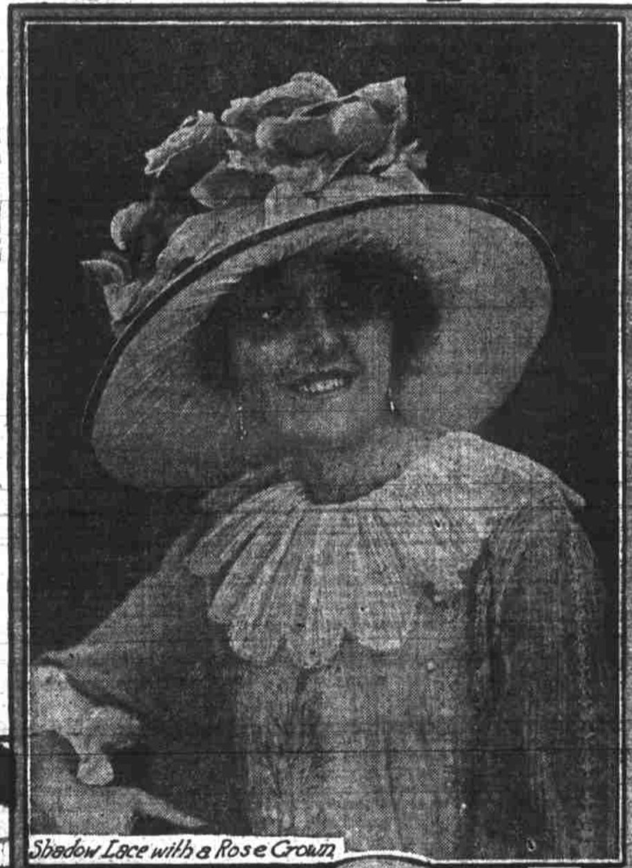
Shadow Lace with a Rose Crown

Surely, as a relief from the straw hat that is already showing signs of wear, these fabric hats offer an inducement hard to ignore. They are representative of the best in the artistic millinery which has been characteristic of the summer. They are eloquent reminders of the fact that beauty and good style go hand-in-hand along the way that is ever interesting to womankind.