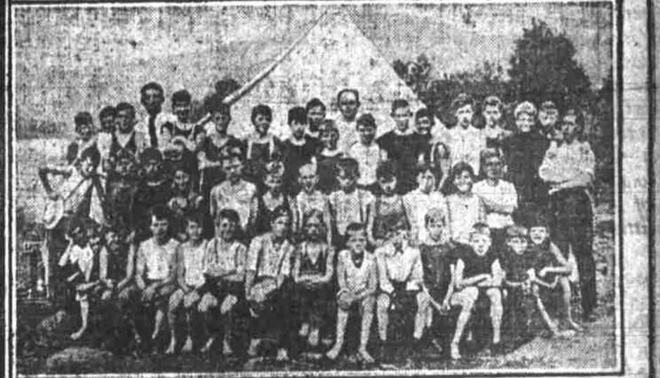
Group of Boys Aided by the Big Brothers