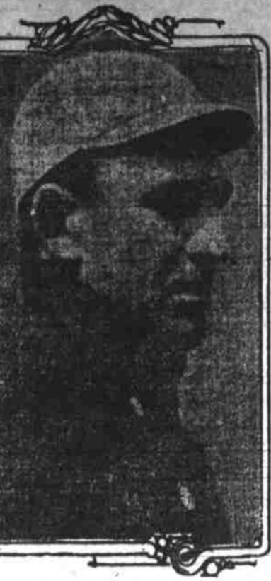
Jake Stahl, who appears in the smaller picture, is heralded as the greatest of all come-back managers, while Speaker has lead the American league in batting during the greater part of the season.