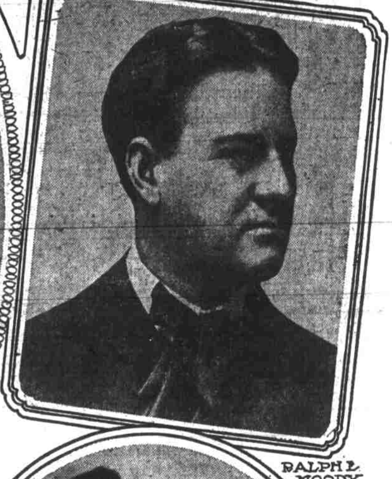
RALPH L. MOODY GRAND LODGE