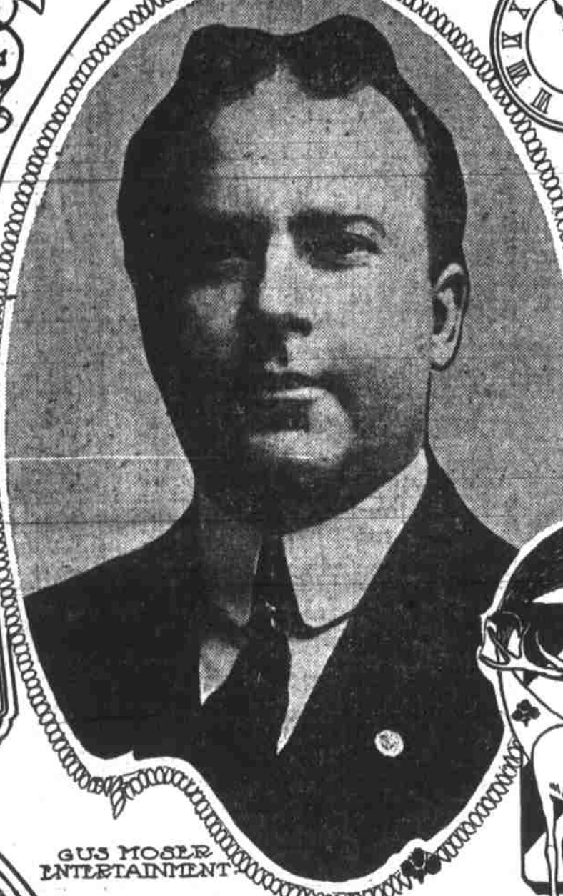
GUS MOSER ENTERTAINMENT