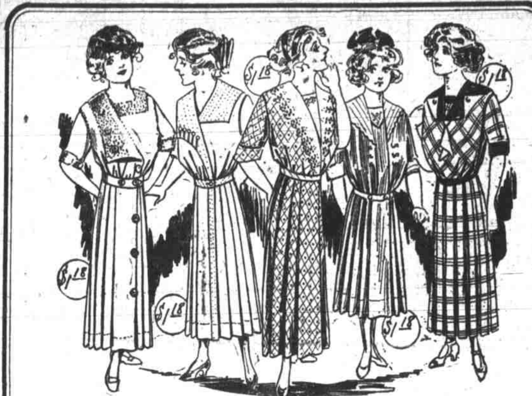
Dresses—Extraordinary in Style, Quality and Price

Big Purchase of Girls' $1.50 To $3.50 Wash Dresses $1.18