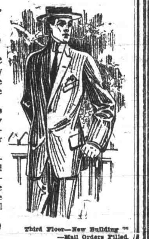
Third Floor—New Building—Mail Orders Filled.

By Fancy Suits we mean everything except the staple blues and blacks. And we've even overstepped this line by adding to the $18.75 sale our finest $25 Blue Serges. All sizes for men of all builds. Your choice tomorrow at only $18.75